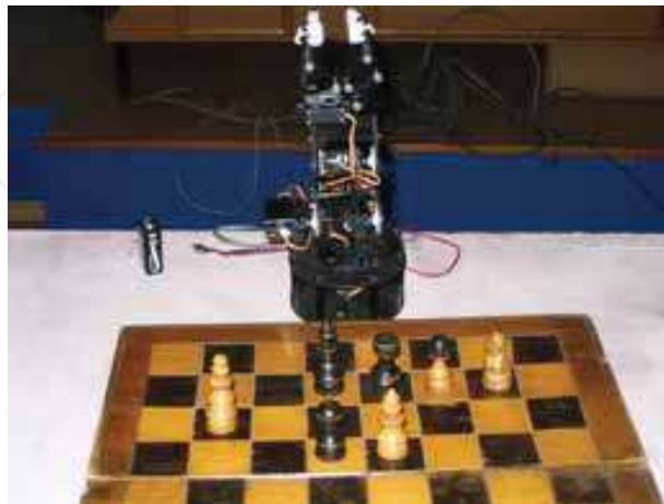
Fig. 4. Chess playing using the robot arm Lynx 5

(Figure 4), video motion detection, sound forced movement, robot dancing etc. We also introduce our students to the robotics applications in medicine, especially to the Brain-Robot Interface paradigm in which recognition of an anticipatory brain potential is acknowledged and reacted to by a robot arm movement.