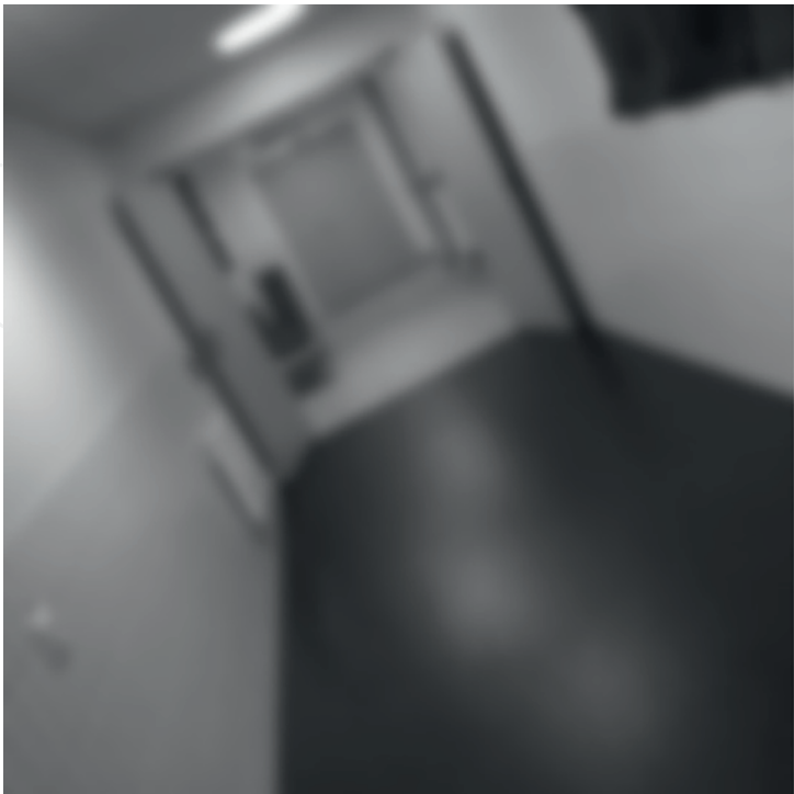
Figure 2. A place experienced as unsafe: Corridor (boy, Year 9).

Even though the school management and administrators tried to stagger the breaks and lunch breaks, crowding nevertheless occurred in certain parts of the school building. In some areas the physical space was insufficient in terms of how the timetable contributed to flows of people and things over the course of a day. Places that were designed for mobility, such as corridors, were described as unsafe by some of the boys (see Figure 2 ). A boy in Year 9 explained: “... you never really know what might happen. Sometimes someone might be bullied or beaten. That’s not OK. They should make the corridor safer than it is.” The use of the word “might” does not make it clear whether something like that had already happened in that particular corridor.