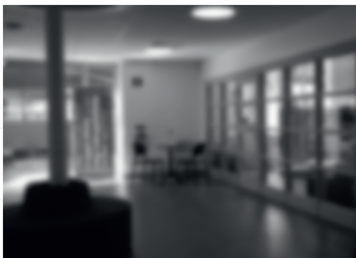
Figure 3. A place experienced as safe: Main corridor/hall (boy, Year 9).