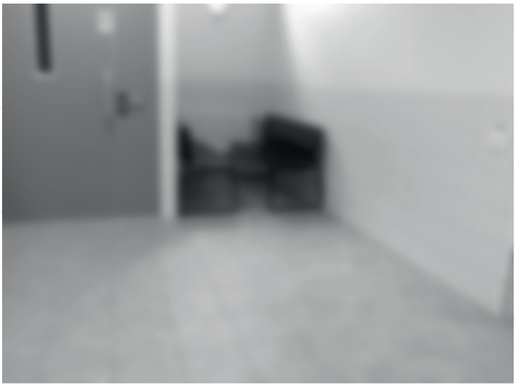
Figure 7. A place experienced as safe: A furnished nook near the science classrooms (boy, Year 8).

The students pointed to spaces such as breakout rooms connected to the class-room and teacher-centred pedagogies as positive, safe and contributing to enhanced