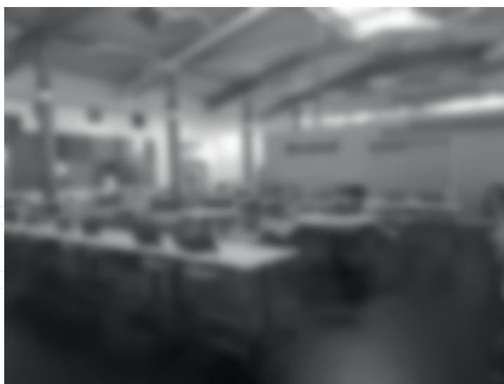
Figure 5. A place experienced as unsafe: The canteen (girl, Year 8).

The dining hall thus became an assemblage of furniture, restaurant equipment, different staff functions and students all flowing together in an intensive period of the day. It was also assumed that the organization and logistics worked well.