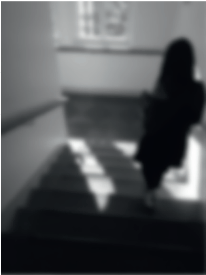
Figure 6. A place experienced as safe: The stairwells (girl, Year 8).