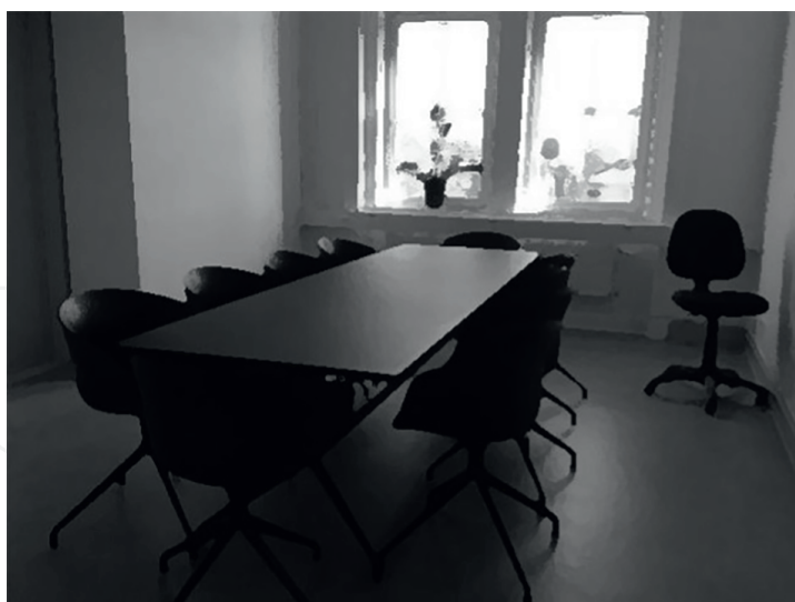
Figure 9. A place experienced as positive for learning: Breakout room (girl, Year 8).

What the example shows is that the school organizing and pedagogical practice match with the support of the teaching space.