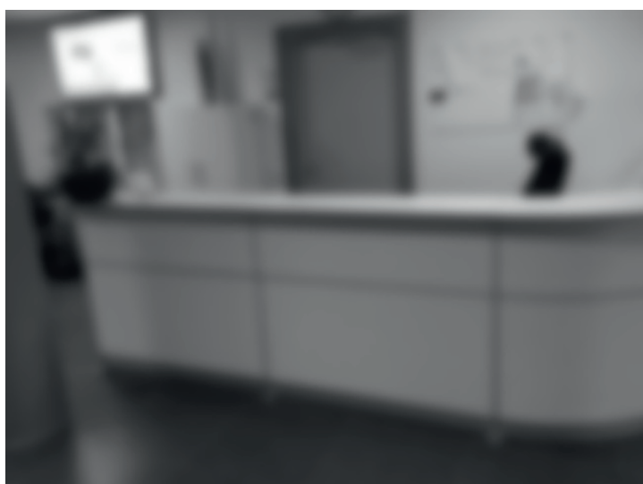
Figure 4. A place experienced as safe: Reception area (boy, Year 9).

The dining hall was yet another intense place, especially at lunchtime when the students arrived for their meals over a short period of time in the middle of the day. 1 Here, in this crowded place, with its constant movement and noise, some students felt unsafe (see Figure 5 ).