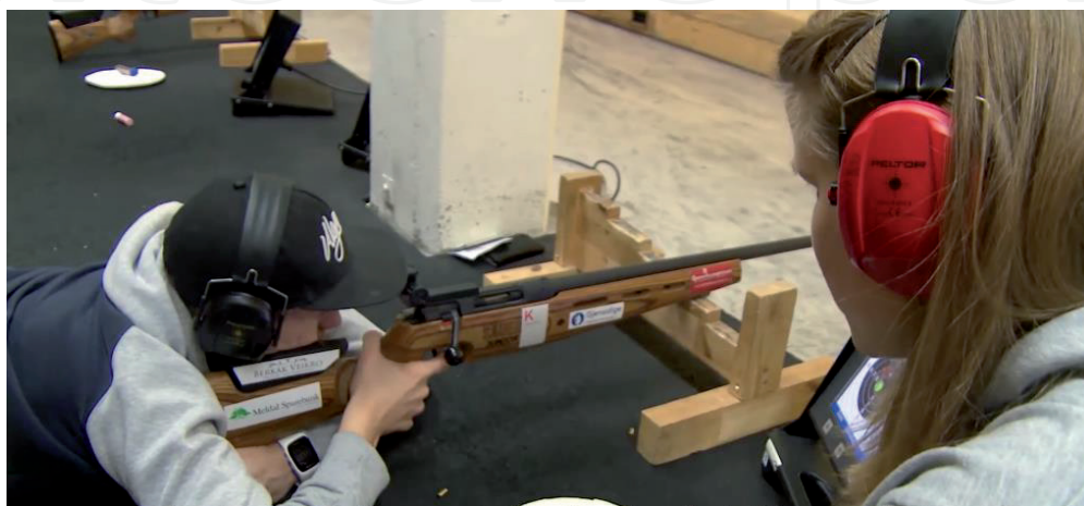
Figure 2. Adapted help by the certificated instructor.

Also of great interests, are qualitative Danish findings [34] that report inhibition of impulsiveness after two or more years with target shooting practice. Our preliminary findings [15] indicate the same. However, a one-year intervention is possibly too short to impact impulsiveness outside the shooting range. In accordance with the Danish