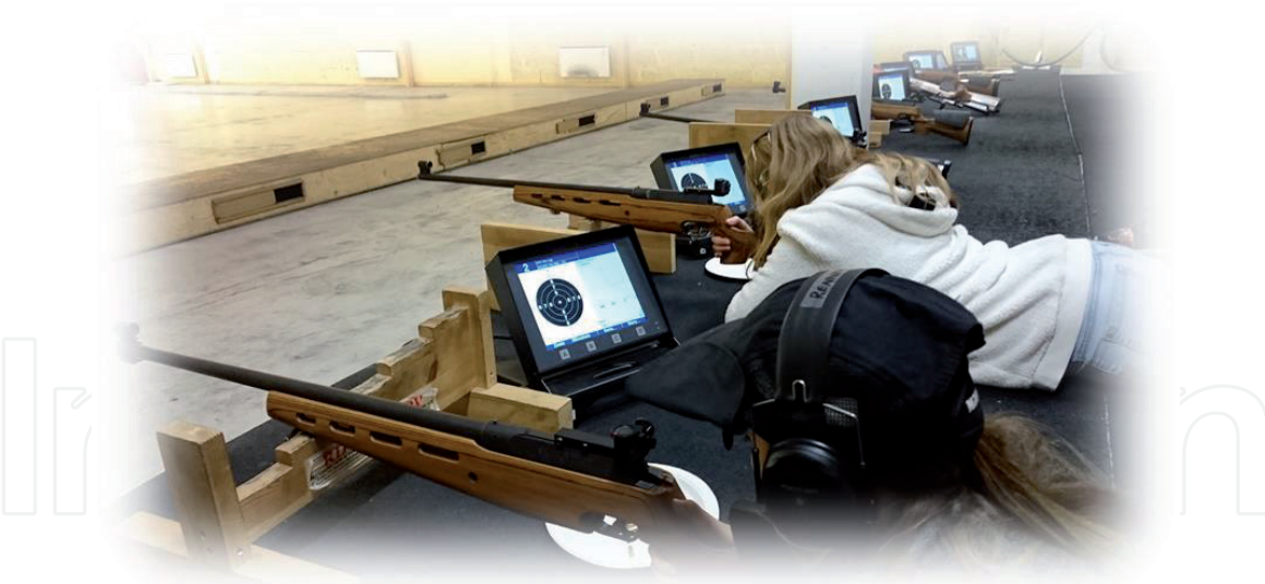
Figure 3. Immediate response on electronic target.

findings [34], the Norwegian instructors underline that they see this sort of change in students who have participated in the programme for at least two years. Maybe the length of intervention time is one of the reasons why a review [27] found no effects of physical activity on disruptive behaviour. Except the length of intervention, another reason behind the promising Danish results [34] as well as the Norwegian instructors' experiences, maybe the theoretical lessons advising how to breathe and behave.