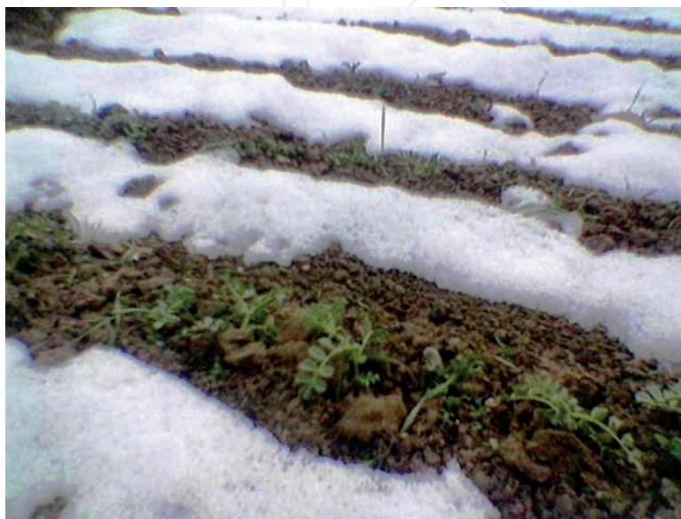
Figure 3. ANA (x03TH130) an Iranian new chickpea cultivar that can withstand at temperatures of -24^{\circ}\text{C} with snow cover in field condition.