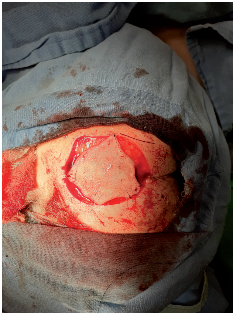
Figure 1. Initial attachment of the Full-skin graft.

The disadvantages of this type of grafts are: limited size of skin for harvesting, donor site will require STSG when primary closure is not possible [12].