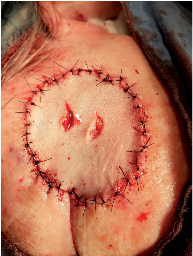
Figure 2. Complete placement of sutures attaching the FSG.