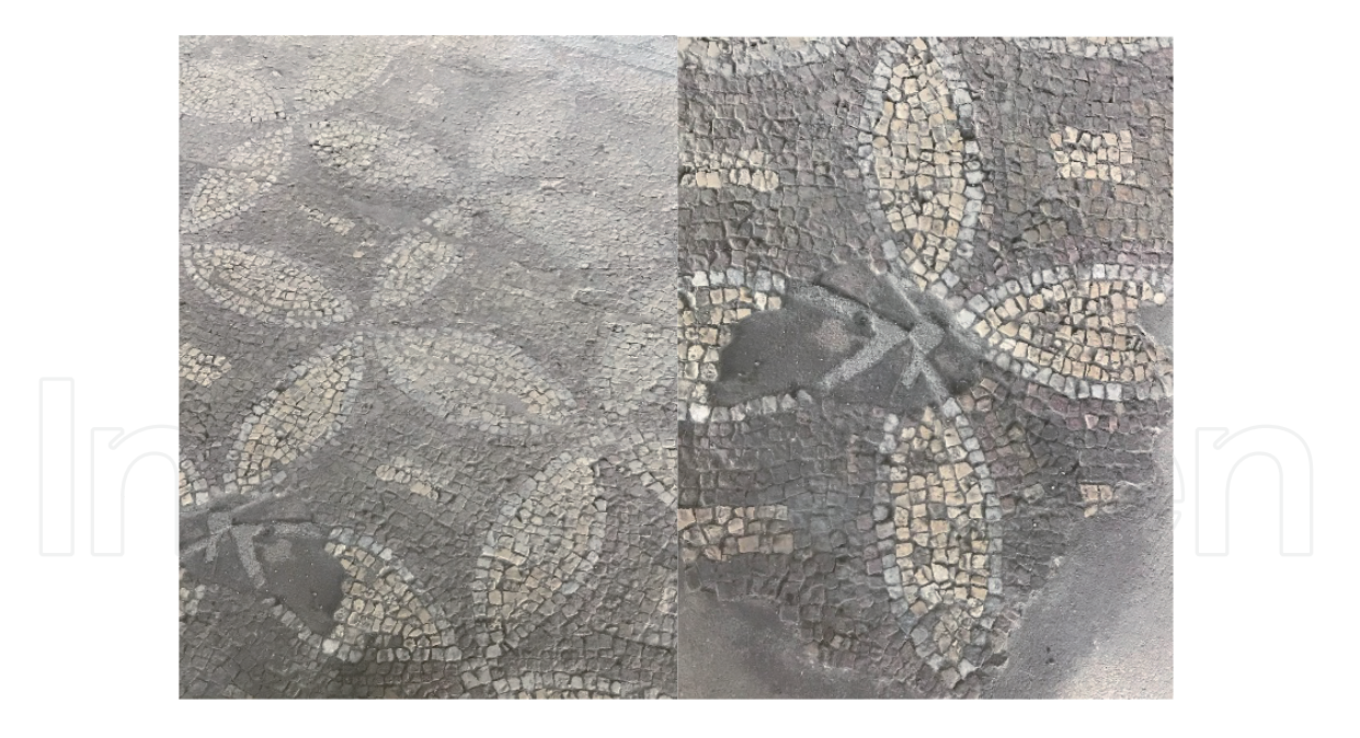
Figure 5. Different images of the artifact.

the restriction of access on the surface of the mosaic, scanning by terrestrial means is not possible in this case. In Figure 5 , it can be seen two shots taken manually at the arbitrary angle but also the effect of non-uniform environmental lighting.