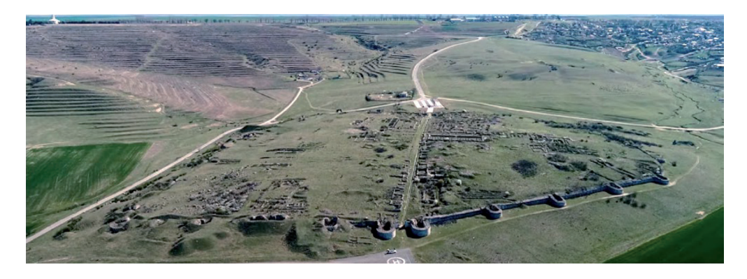
Figure 3. The Adamclisi Fortess ruins in Dobrogea, Romania.