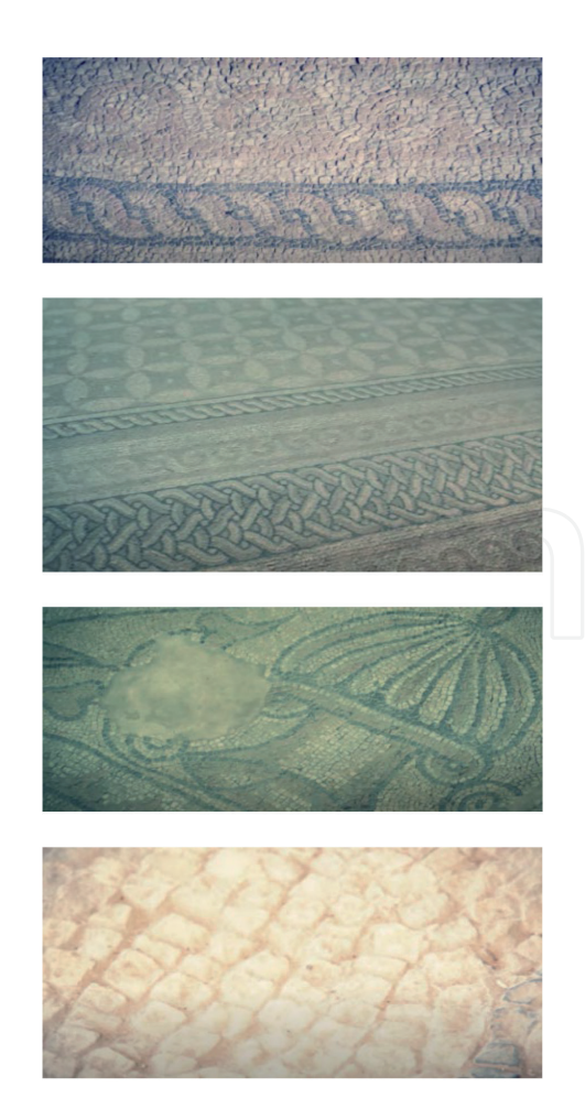
(b) details of the arifact