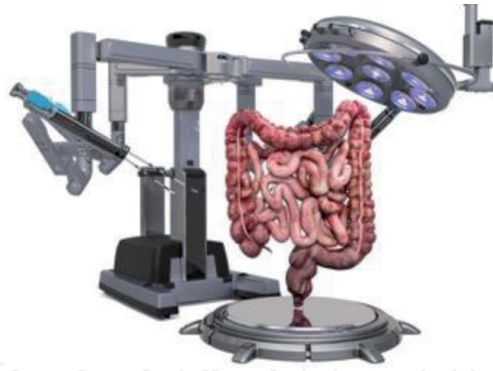
Figure 3. A surgical robot and the schematic approach to the colorectal area.