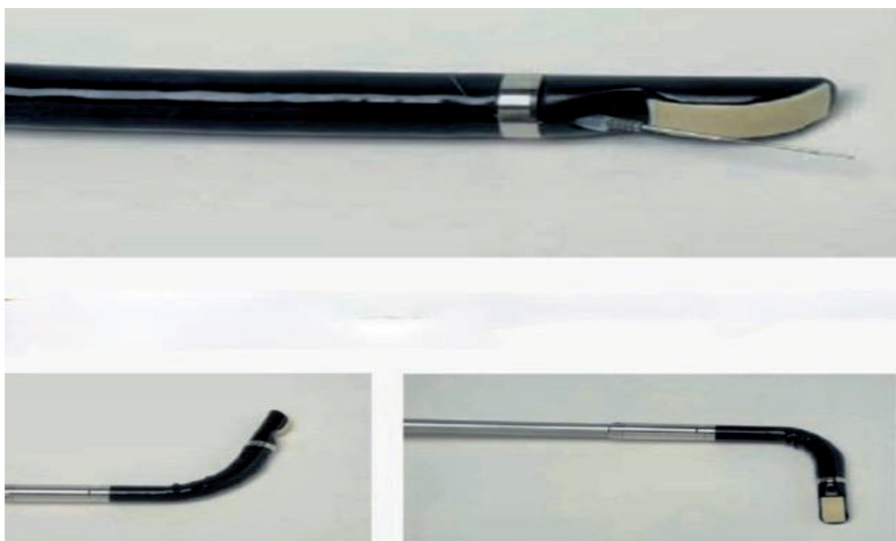
Figure 2. (a-c) A laparoscopic probe has a needle biopsy enhancement (a, above) and two lower images (b, c) showing the flexibility of the tip of the probe.