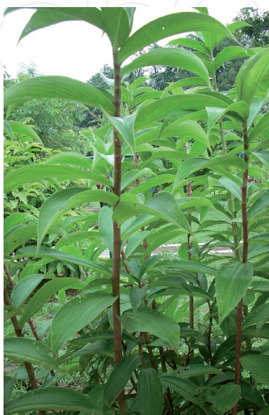
Figure 2. C. speciosus (J. Konig) Smith collected from Nagakhelia village, Dibrugarh.

Costus scaber ( Figure 3 ) is an erect plant, up to 4 meters high; root stock is tuberous; stem is sub-woody at the base. Leaf shape is elliptical with entire margin and