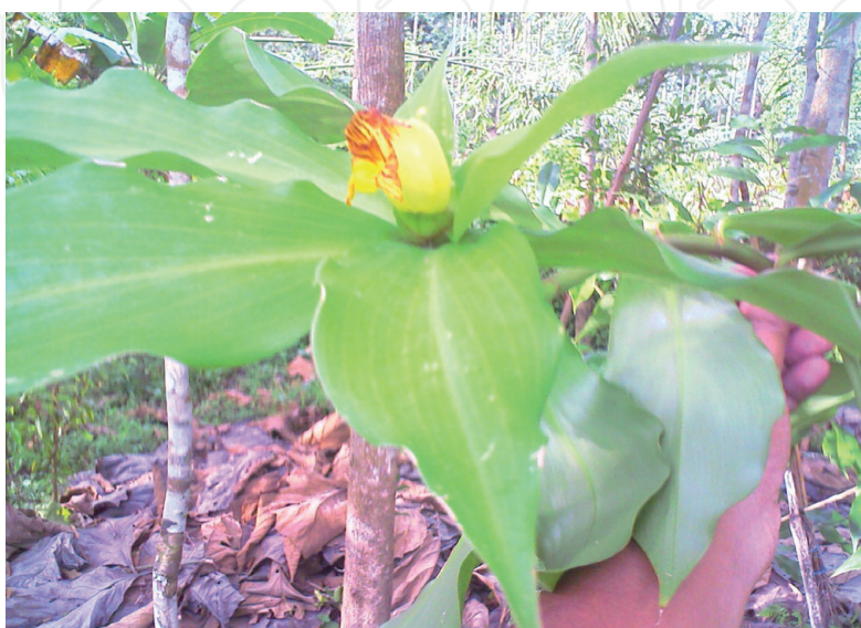
Figure 4. C. pictus D. Don collected from Naojan, Golaghat.

Costus pictus ( Figure 4 ) is a plant that goes upto 3 meters in height; it has tuberous root with a nearly woody base. The leaf arrangement is spiral with an elliptical shape. Leaf bears rigid and rubbery morphology. Spiral phyllotaxy is observed in