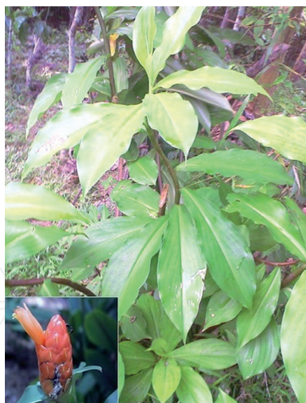
Figure 3. Costus scaber collected from Dhemaji (insert: flower specimen).

are spirally arranged around the stem. The primary bracts are borne on the inflorescence in spiral phyllotaxy. One flowered cincinni occur in the axils of these bracts. Each cincinnus consists of an axis bearing a terminal flower [17]. The floral organs are formed sequentially starting with calyx. Flowering time in Indian condition is October to December.