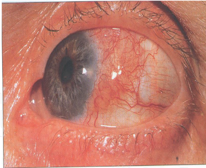
Figure 3. Episcleritis.