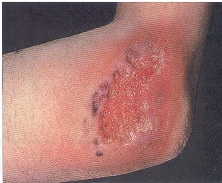
Figure 2. Pyoderma gangrenosum.

disease activity. Histologically it is a neutrophilic dermatosis characterized by infiltration of neutrophils into the skin. Pathergy phenomenon (i.e. formation of large ulcers in response to minor trauma) is characteristic of PG. PG heals up with cribriform scars ( Figure 2 ).