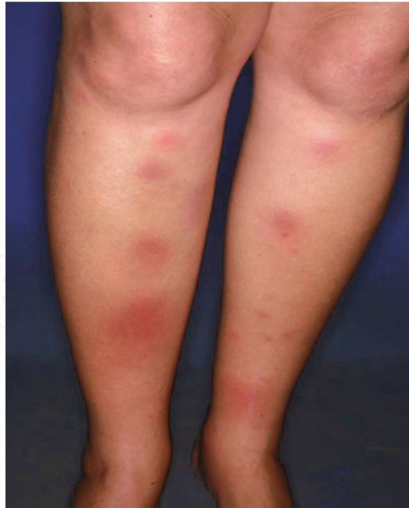
Figure 1. Erythema nodosum.