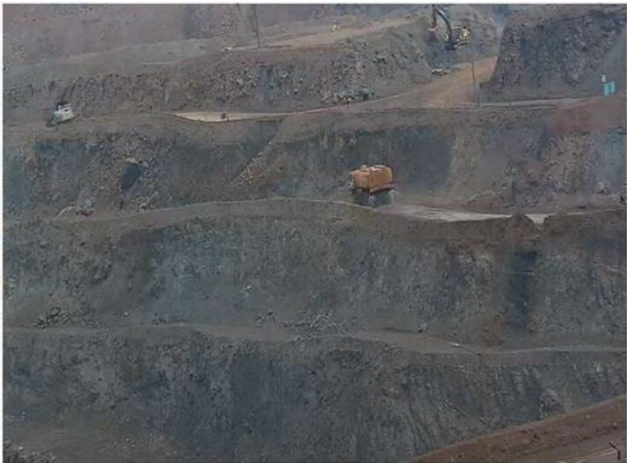
Figure 5. Mining activity at JIMOM.