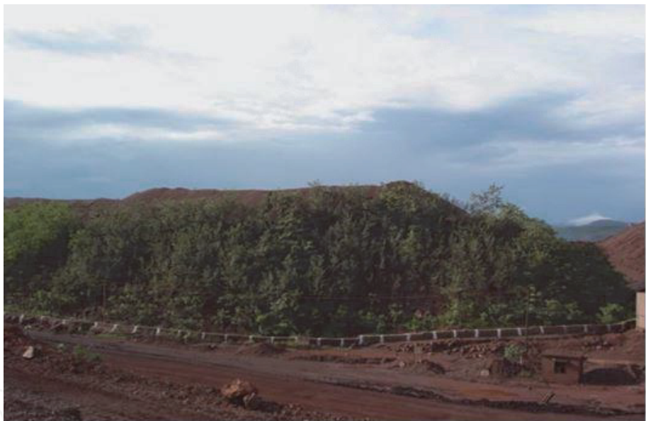
Figure 4. Dump area (DA) of JIMOM.

Soil analytic report comprises of some physical and chemical parameters are used to validate the fertility and health status of soil in this area is presented in Table 1 . Physical parameters (sand, silt and clay percentage) related to the development of soil structure indicated that the soil of the area is loamy with some proportions of silt and clay. The depth varies from shallow (0-30 cm) and medium (31–50 cm) to moderately deep (51-80 cm). Most areas have medium-depth soil. More than half of the area has moderate to good water holding capacity. Chemical parameters encompass pH, nitrogen, phosphorus, potassium and organic carbon mostly related to soil fertility inferred that the soil is slightly acidic and adequate in the required nutrient parameters (potassium, phosphorus and nitrogen) to afford plant growth [23].