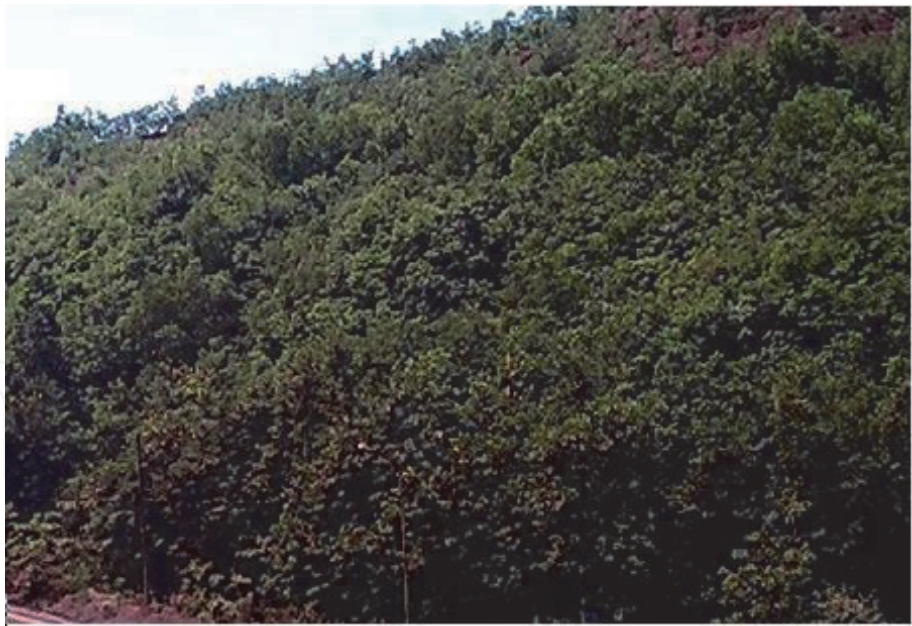
Figure 3. Forest area (FA) of JIMOM.