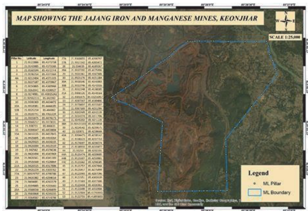
Figure 1. Google earth view of Jajang iron and manganese ore mine at Keonjhar. ML: Mining lease.