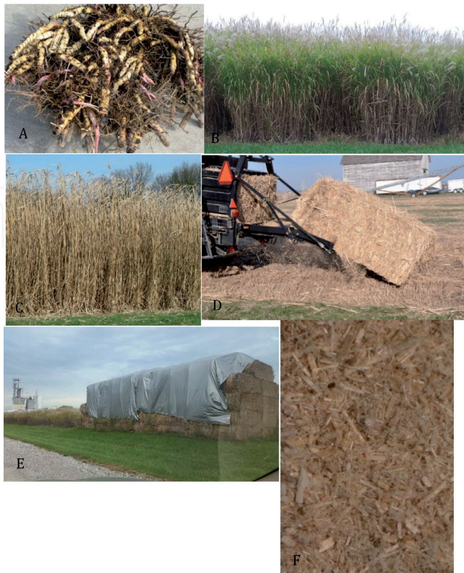
Figure 1. Miscanthus x giganteus rhizome (A; from Adams et al. [9]), growth stage approximately 2.5 m (B); dried (C; from Adams et al. [9]); baled (D; from Adams et al. [9]), stored bales (E), and ground (F; from Pontius et al. [10]) with a particle size of 134 \pm 93 \mu\text{m} and a 5X magnification.

the rhizomes at the end of the growing season when the aerial portion of the plant begins to senesce ( Figure 1C ) [16]. This senescence starts with a killing frost during fall [21]. Predation by insects is limited [22]. As a result, this plant has been primarily utilized for biomass production; although, there may be more value for this crop than has been identified to date.