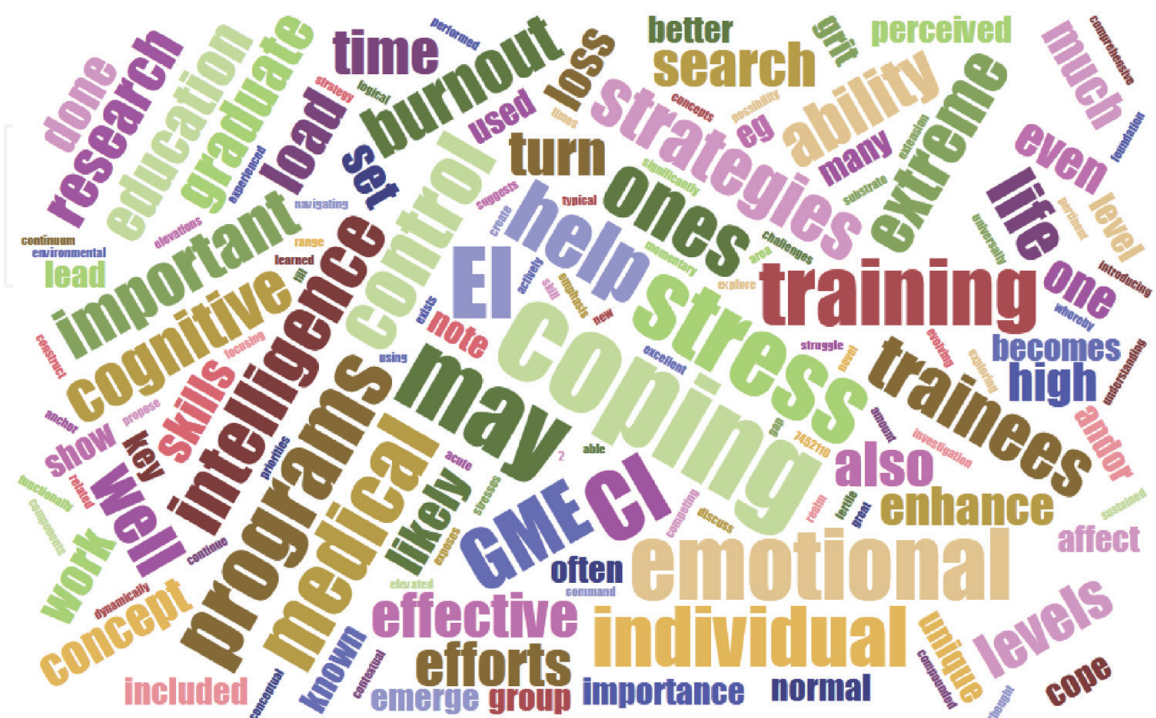
Figure 1. Word cloud representing key words and phrases in this chapter.

Research pertinent to this manuscript was performed using a comprehensive literature search strategy. Internet-based indexing and search platforms used during the preparation of this manuscript included Google™ Scholar, PubMed, and Bioline International. Specific search terms included, but were not limited to, “coping intelligence,” “graduate medical education,” “emotional intelligence,” “cognitive load,” “coping strategies,” “leadership,” “medical training,” and “wellness.” Out of a total of 7,452,110 initial search results, we narrowed down our reference list to approximately 472 results highly specific to our intended area of focus. Further screened and excluded were sources that did not specifically address the concept of coping and/or its relevance and connection to “emotional intelligence” as well as medicine/medical training. After the above screening was completed, our literature sources were narrowed down to the list of 107 citations included herein. Word cloud representative of key terms pertinent to the current chapter is shown in Figure 1 .