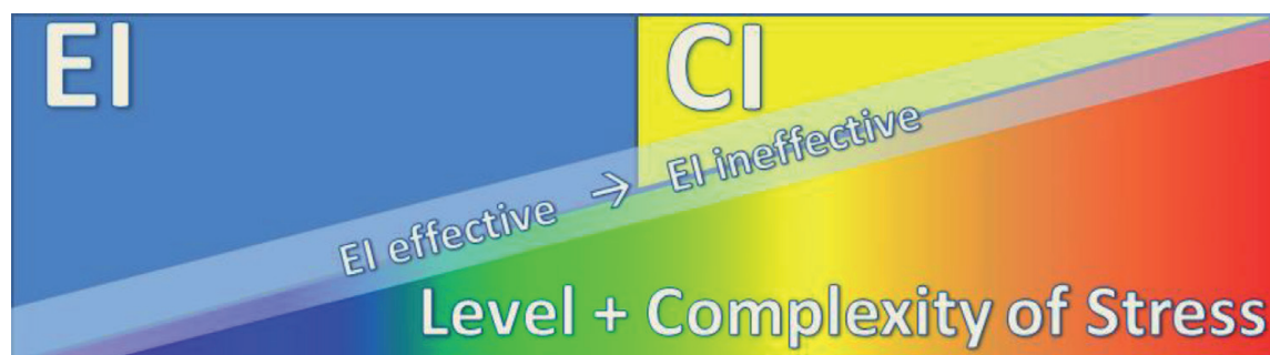
Figure 3. Simplified diagram showing the ability to transition from “routine” emotional intelligence (EI) skillset to a “more specialized” coping intelligence skillset can be viewed in the context of escalating levels and complexities of stress.

Second, those who made sufficient progress in their EI training (as evidenced through significant improvement on repeat standardized EI assessment tools) should be gradually introduced to the concept of CI. Experience-based group discussions are well suited toward increasing one’s awareness that the ability to handle emotions under ‘normal circumstances’ has its limits, and that despite one’s best efforts there are instances where ‘extreme pressure’ may result in loss of emotional control ( Figure 3 ).