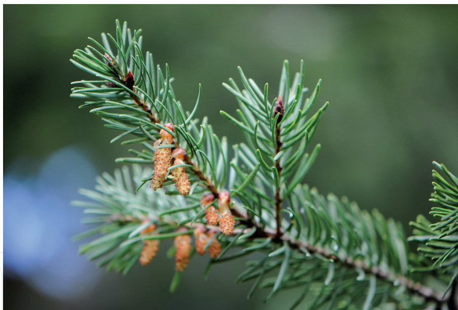
Figure 2. Pseudotsuga menziesii (Douglas fir) [3].

or basaltic rock. It grows best on alluvial soils with a relatively high ground water table. Rapid growth and great size make this species an important tree for producing timber. The wood is soft and white and an excellent source of pulpwood. Young trees are valued as Christmas trees because they tend to grow very symmetrically and have glossy green foliage. Grand fir is a common sight in large gardens and city parks and it was planted in nearly all landscape gardens laid out in the nineteenth century in Europe [8].