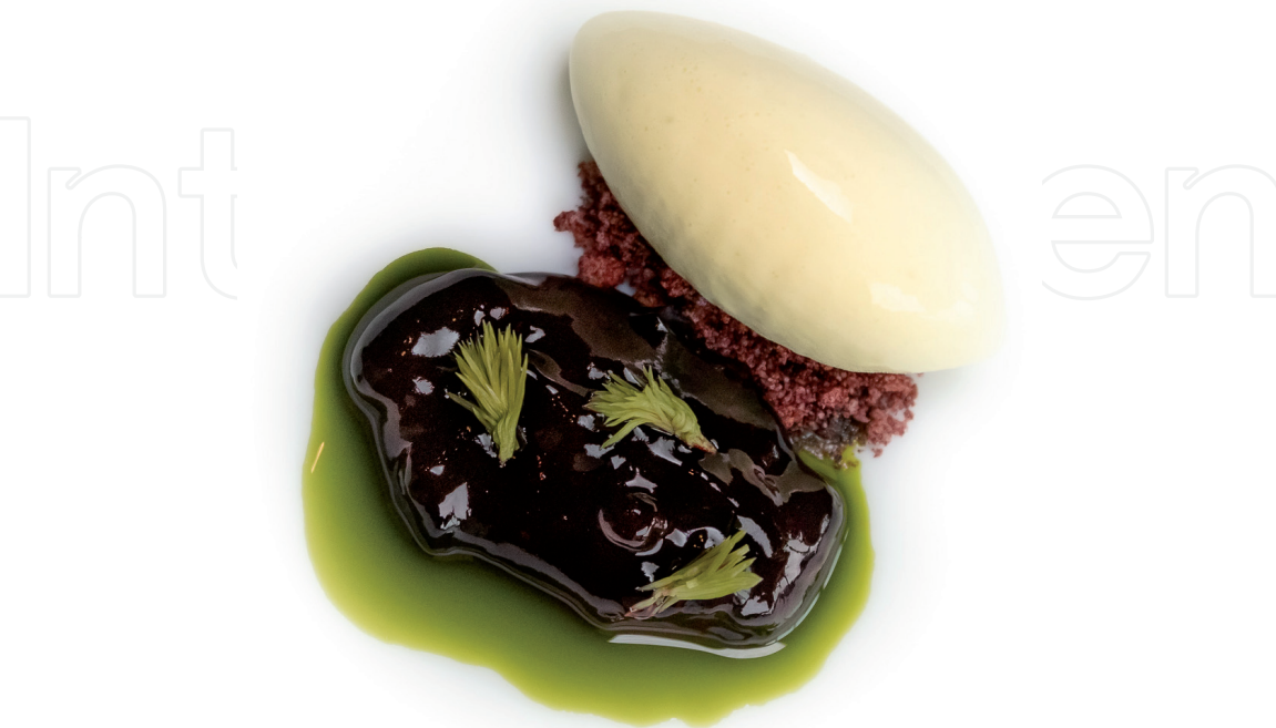
Figure 6. Dessert: Abies grandis ice cream and spruce garnishes.

Douglas fir spirit was used to make a version of a gin tonic, replacing the gin with the Douglas fir spirit and drops of Douglas fir syrup ( Figure 7 ).