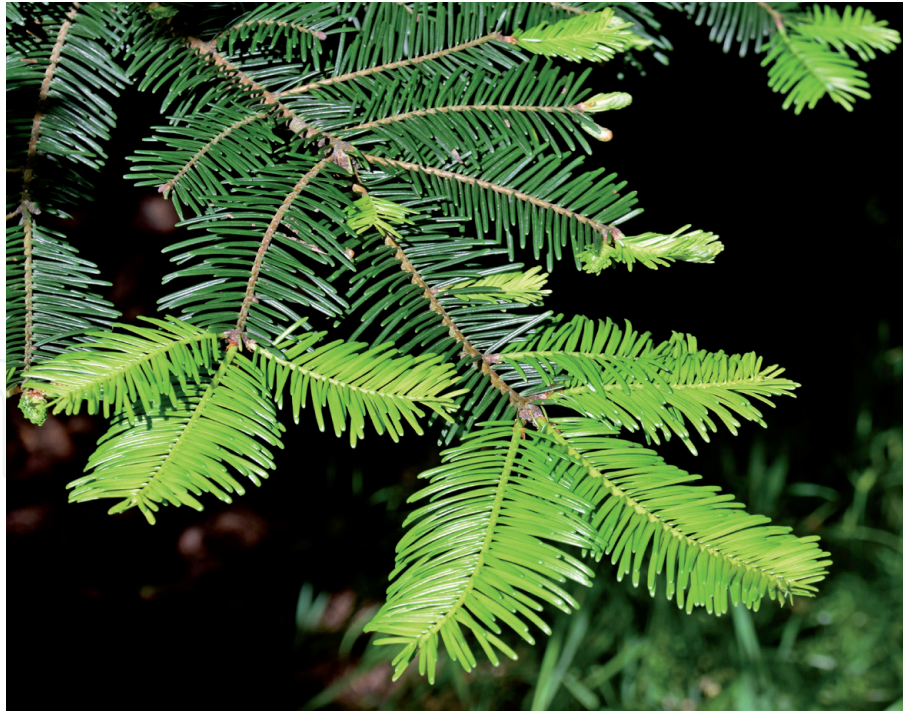
Figure 1. Abies grandis (Grand fir) [2].