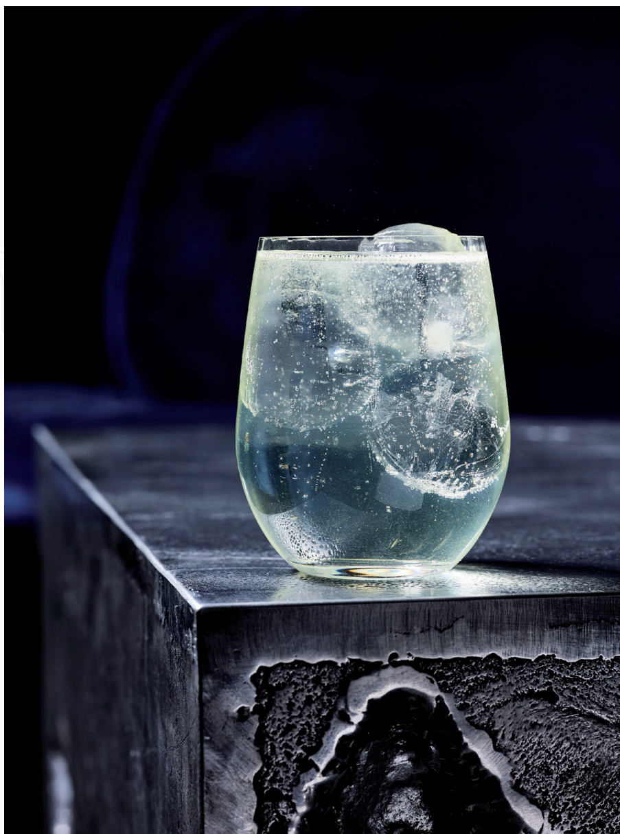
Figure 7. Cocktail: Spruce tonic.