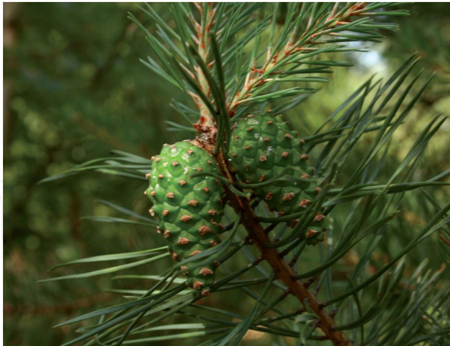
Figure 3. Pinus sylvestris (Scots pine) [4].