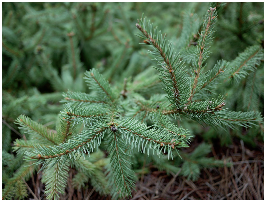
Figure 4. Picea abies (Norway spruce) [5].

in valley bottoms near streams, still reaching great height and living up to 800–1,000 years. These coniferous forests are of similar composition as those on the coast. Var. glauca is a smaller, but still quite large tree that grows in the Rocky Mountains [9].