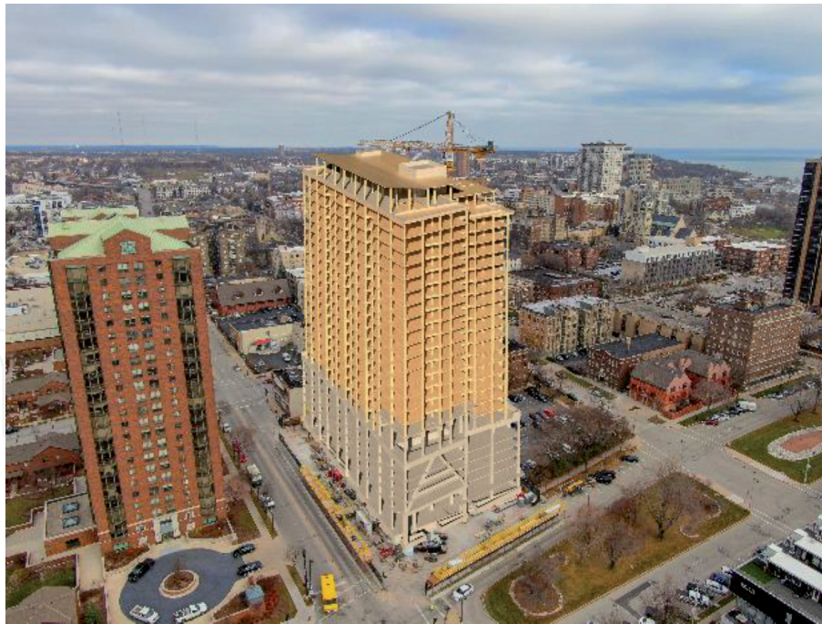
Figure 2. 25-story Ascent building built with mass timber products in Milwaukee Wisconsin US.

or a system [9–11]. In the case of wood products LCA, an attributional LCA, for example, provides information about the amount of GHG released during manufacturing of a unit ( \text{m}^3 ) of lumber or CLT. In contrast, a consequential LCA evaluates overall greenhouse gas (GHG) emission, of increased demand for lumber or CLT use in buildings, including both direct (within system boundary) and indirect (e.g., change in forest land use) effects resulting from such increased demand.