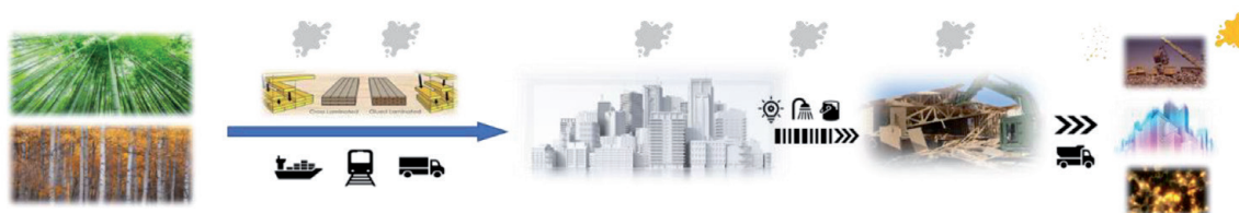
Figure 4. Carbon life cycle of the EWPs in construction.

A mass timber building can serve as a carbon reservoir over the building lifespan, which can potentially assist in the mitigation of climate change. Mass timber buildings not only store carbon in the structure, but they can also help sequester more carbon in forests via two mechanisms. First, in a sustainably managed forest, harvesting mature stands and replanting lead to an increased carbon sequestration rate compared to merely maintaining mature stands. Second, increased demand for wood products use in buildings may lead to timber price increases, which may provide economic incentives to invest in intensified forest management activities and/or plantation, which can further lead to increased forest growth and carbon sequestration [16]. When building with wood products, carbon sequestered by trees is transferred into urban buildings and stored for extended periods of time before being released back into the atmosphere upon the building's decommissioning or renovation, through landfill emissions or burning for energy, as depicted in Figure 4 . Such an extended time delay of carbon emissions has been recognized as an effective way to mitigate climate change.