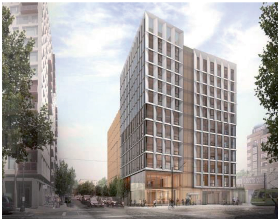
Figure 1. 12-story framework building with mass timber from ground floor (not built) designed for Portland Oregon US (Credit: Lever Architecture).

Environmental impacts of engineered wood products and mass timber use in construction can be evaluated within two LCA frameworks. An attributional LCA evaluates environmental impacts of manufacturing, installation, use, and disposal of a product (9–10). In contrast, a consequential LCA evaluates change in environmental impacts due to a change in product output or a change in a service