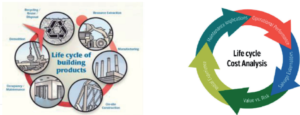
Figure 5. Building life cycle stages for LCA and life cycle cost analysis.

landfills should be avoided, and recycling and reuse should be first principles in waste management for mass timber and EWPs.