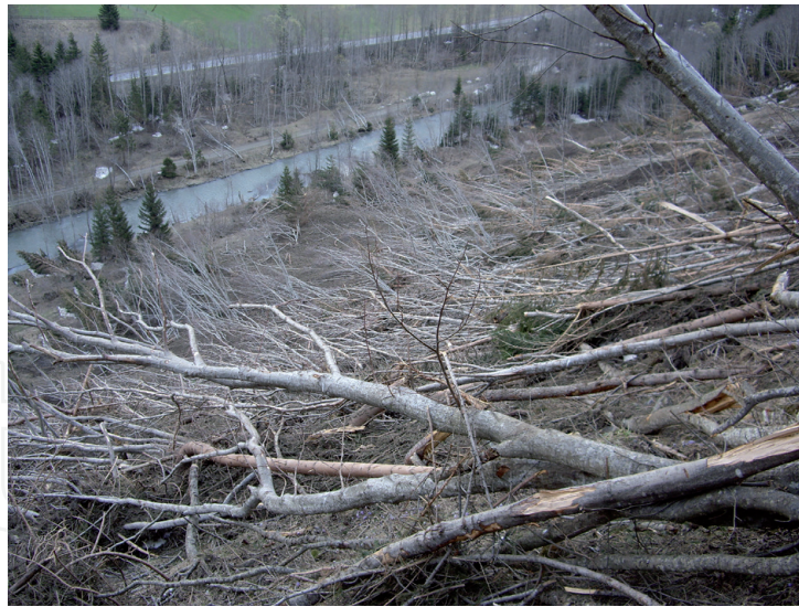
Figure 4. Destruction of a young deciduous forest by an avalanche.