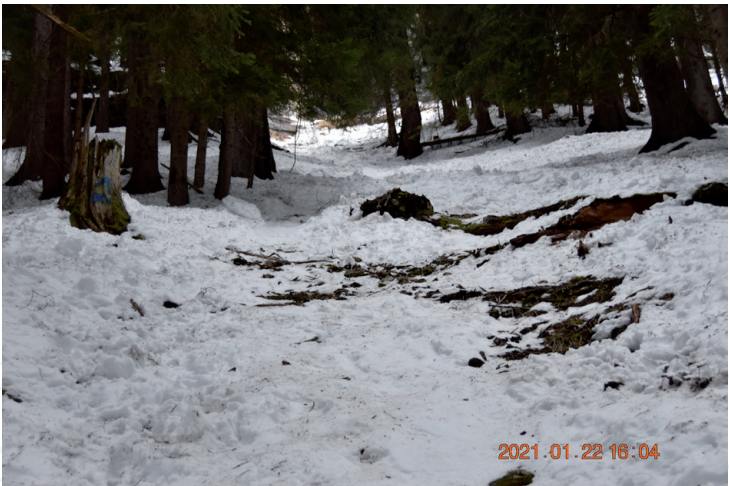
Figure 2. Release of a snow avalanche in a spruce forest triggered by air temperature rise from -12 to 6^{\circ}\text{C} within few hours. The 208 m long avalanche with a vertical drop of 147 m buried a local road. Photo: F. Perzl, 2021.

The literature on protective stem densities is based on different analytical approaches and they vary considerably. They refer to different caliper thresholds and mean diameters of the stems at breast height (DBH). Thresholds of protective stem densities are usually related to slope inclination. Approaches based on mechanical calculations show stem densities needed to stabilize the snowpack, for example with an average DBH of 5 cm, from about 2,000 on gentle slopes to more than 10,000 stems per hectare on steep slopes [34, 36]. These calculations are very sensitive to slope, DBH and snow conditions. Observations and statistical approaches [14, 16, 26] usually do not confirm them. Figure 3 shows stem densities recommended by the European guidelines to stabilize snowpack versus a sample of 142 observed snow avalanche initiations in forests mainly provided by a Swiss database [14]. Based on this sample, the miss rates (FNR) of the guidelines are low, not exceeding 15%. However, most of the guidelines tend to propose quite higher stem densities than observed and underestimate the effects of the trees [7]. Snow avalanche initiations in forests with stem densities of more than 900 per hectares (DBH >6 cm) seem to be statistical outliers allocated to deciduous broadleaved and mixed forests on very steep slopes [7].