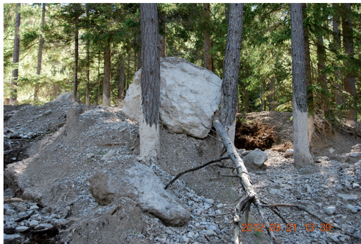
Figure 7. Detrainment of coarse debris from a debris flow by forest at the alluvial fan. Photo: F. Perzl, 2012.

Trees and coarse woody debris can retain mobilized sediments and therefore reduce hillslope and torrential debris flows [75–79]. Large-scale datasets indicate lower frequencies [80] and runout lengths [81] of debris flows and debris avalanches in mature forests in relation to other land uses or clear-cuts and young forest. However, the reduction of runout lengths may be an effect of smaller landslide densities and erosion volumes in mature forests rather than a barrier effect [76]. Results of [78] indicate a higher potential of trees and logs to retain debris at low-order section of rivers than on alluvial fans. Detrainment of debris on alluvial fans by forest depends on sediment concentration and tree density [82]. Trees increase the flow resistance and favor the deposition of materials due to detrainment of (coarse) debris, but the protective effect is difficult to assess ( Figure 7 ).