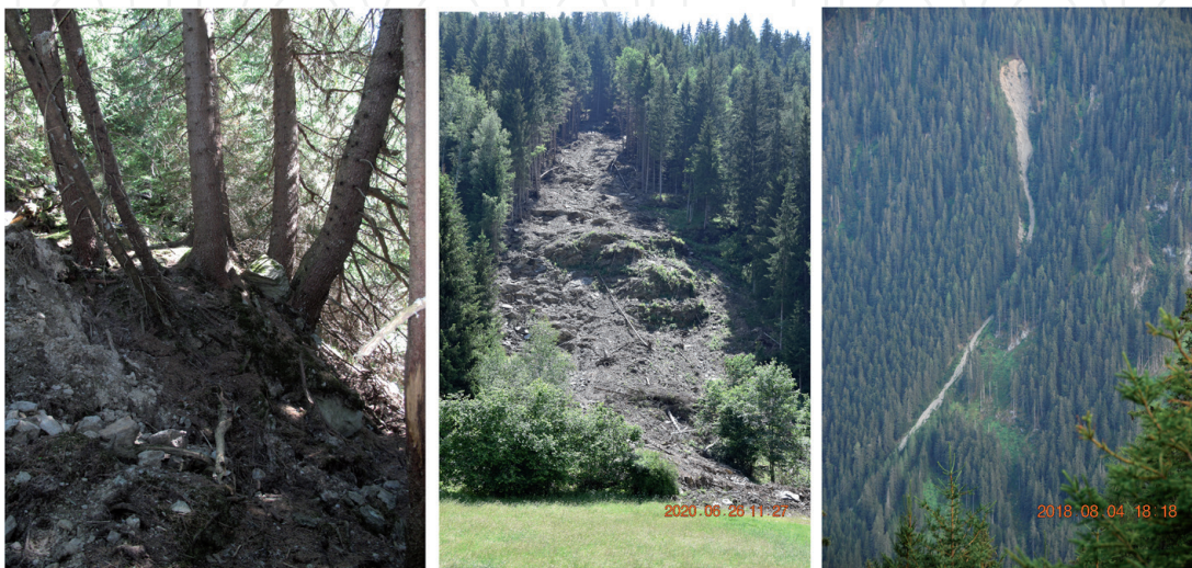
Figure 6. Left – soil clod grown by trees moving downslope on a permanent landslide, center – debris avalanche, right – debris flow in forest.

Forests enhance slope stability by A) dewatering due to evapotranspiration, B) internal redistribution of water due to the hydraulic lift (maintenance of