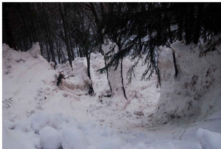
Figure 5. Detrainment of avalanche snow by trees.

surface roughness on short-slopes and to promoting stand stability by species selection, formation of resistant individuals and acceptance of shrub-dominated growth.