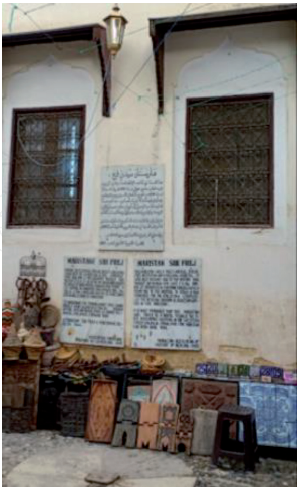
Figure 1. Photo showing the original site of the hospital have been turned into bazaar selling souvenirs.

As recorded by Ibn Iyas [33], the endowment ( waqf ) documents required the hospital to comply with two stipulations. The first precondition was that an ensemble of musicians would play musical instruments, such as oud, every evening to