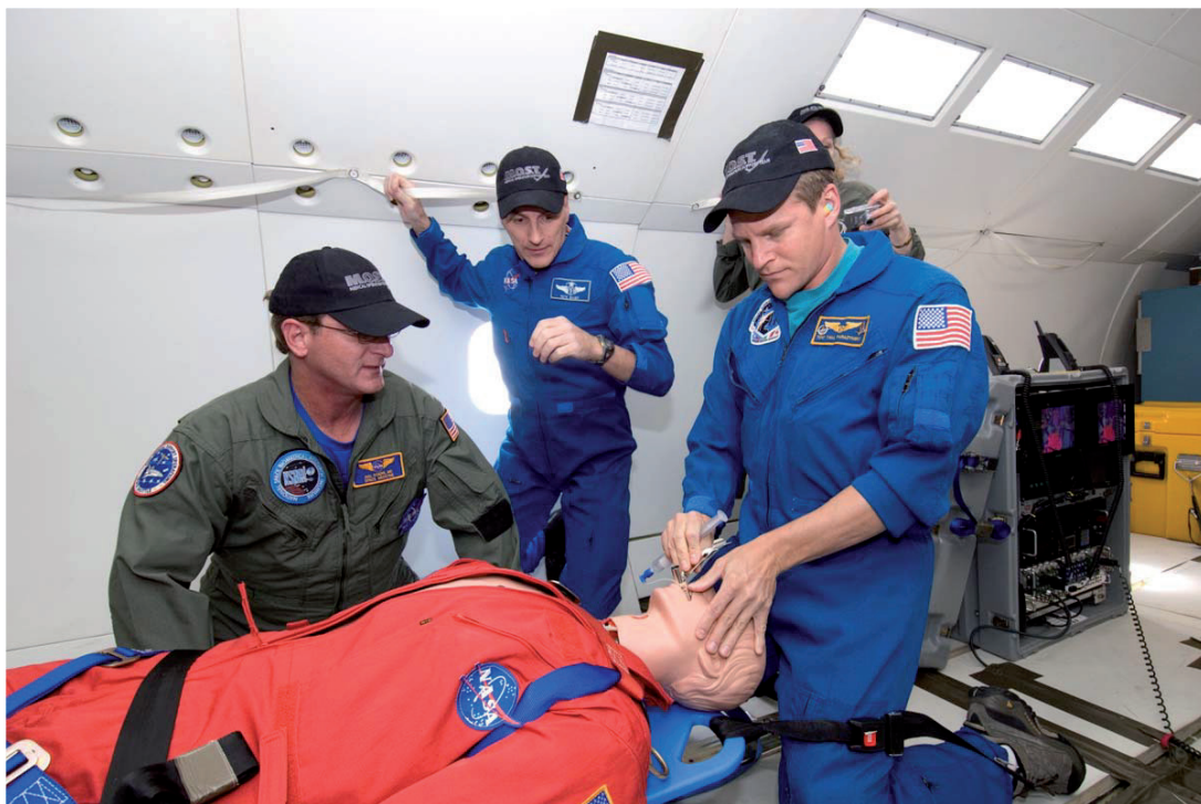
Figure 1. Simulation of microgravity environment and intubation in restrained mannequin with a demonstration of sniffing position.

Assessment of respiratory failure or the need for airway management can be evaluated by assessment that includes observation of the ventilatory pattern, pulse oximetry and vital signs; after which and if required, the patient must be moved