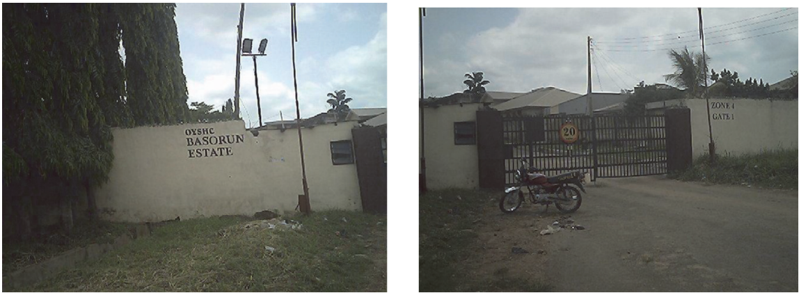
Figure 29. View of Oyo-state, housing corporation; Basorun estate zone 4, GATE 1.