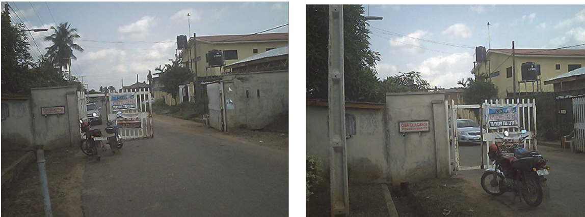
Figure 7. Picture showing Oba Olagbegi Neighbourhood in OBS.