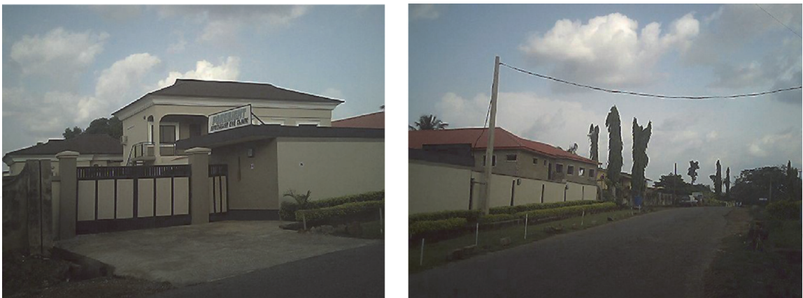
Figure 14. View of streets in Awosika that shows an example of well maintains neighbourhood.

hand with an index of 5.0 each while KIS takes the rear with an index of 2.8. This shows that even though all the study areas enjoyed some level of commercial activities, OBS and NBS are exceptional. In terms of quality of surveillance, which is exemplified by the number of eyes on the street OBS and NBS again take the lead with an index of 4.0 while KIS again brings up the rear at 2.0. In summary, NBS seems to have the highest index of surveillance with a value of 3.74. The highest contributor to this being the type of Level of commercial activities in or near neighbourhood at a value of 5.0 while KIS seems to have the least index of surveillance at 2.80, the biggest contributor to this being the level of Surveillance potential of land use in or around the units with a value of 3.4 OBS, Agodi GRA and ALGRA seems to be strong on surveillance in their units.