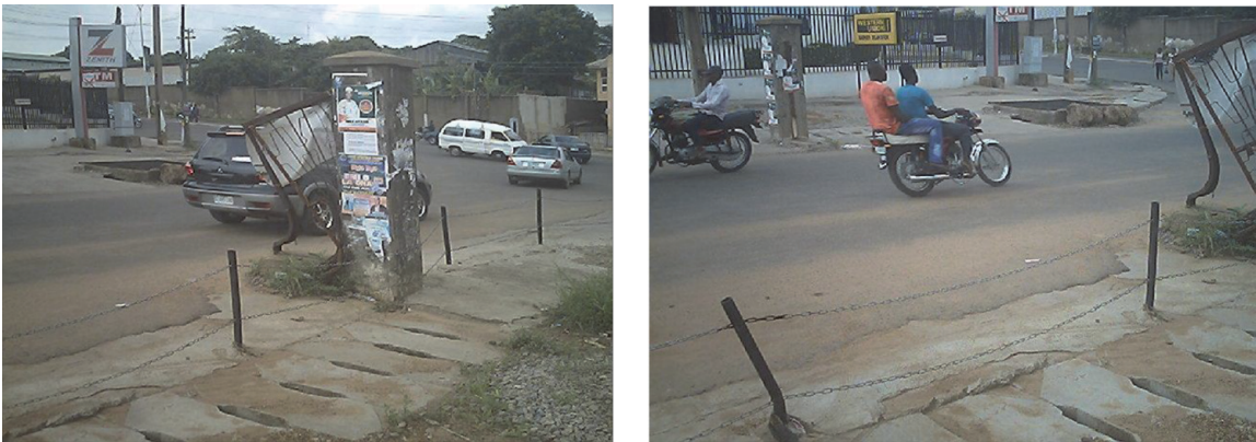
Figure 8. Picture showing derelict gate at Oshuntokun road, old Bodija.