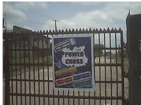
Figure 26. View of Oyo-state, housing corporation; Basorun estate zone 7, GATE 3.