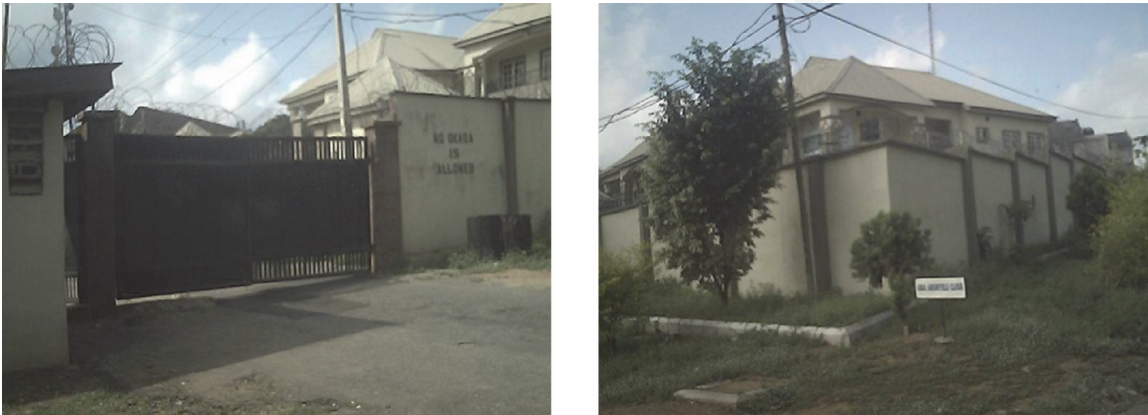
Figure 18. View of the entrance gate to a closed neighbourhood in Agodi GRA.