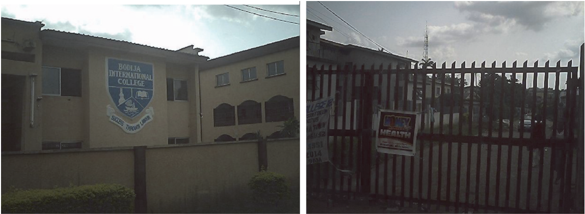
Figure 10. Picture: A view of a school and an enclosed street in OBS.