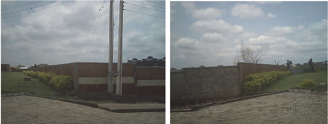
Figure 24. Wall around Gatton gate estate.

allow visitors to be vetted by residents. GCs have guards at the gates and also security agent patrolling the premises. In some areas, guards may carry automatic weapons.