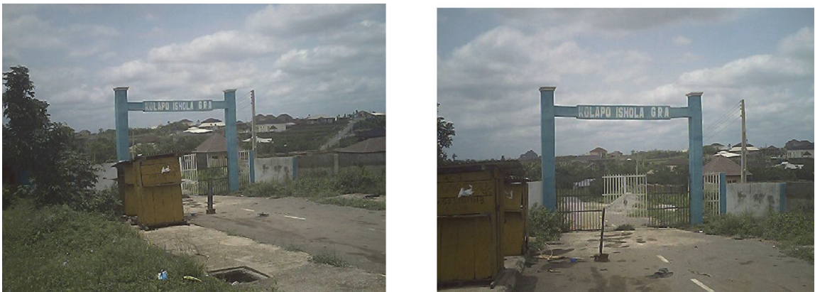
Figure 5. The exits gate under lock and key in Kolapo Ishola GC.

In the case of surveillance potential of land use, Table 5 shows that NBS seems to have the advantage with an index of 3.6 while OBS and ALGRA did not seem to do well at an index of 3.0. However, the proximity of the indices around an average 3.0 shows that the study areas are not far apart from each other and that they did not do too badly especially as the least is 3.0. Considering the level of commercial activities in or near a neighbourhood in the study areas, OBS and NBS seem to take the upper