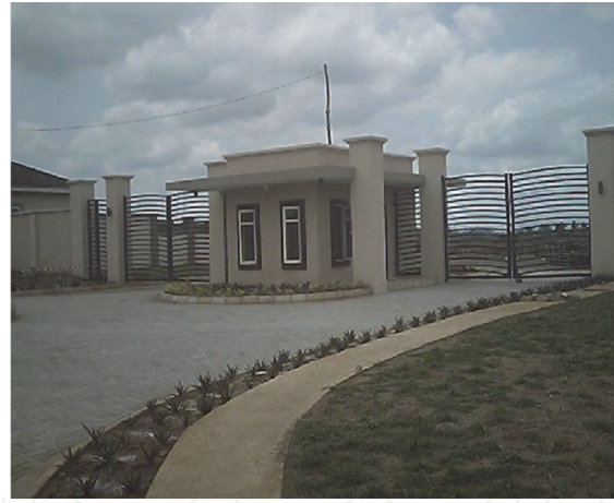
Figure 21. View of legacy estate gate within Kolapo Ishola GC.