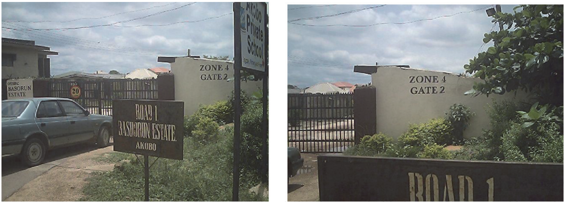
Figure 31. View of Oyo-state, housing corporation; Basorun estate zone 4, GATE 2.