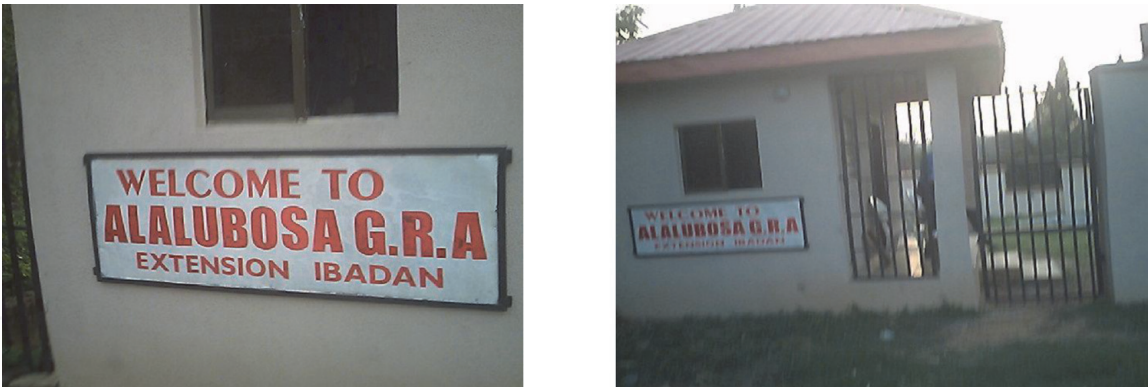
Figure 2. Demonstration of ownership in ALGRA.