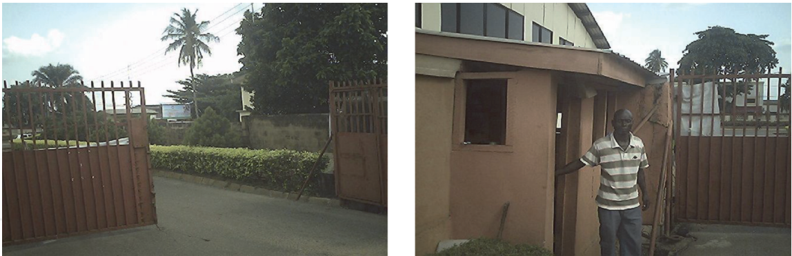
Figure 9. Picture showing gating and security guard at Awogboro Neighbourhood in OBS.