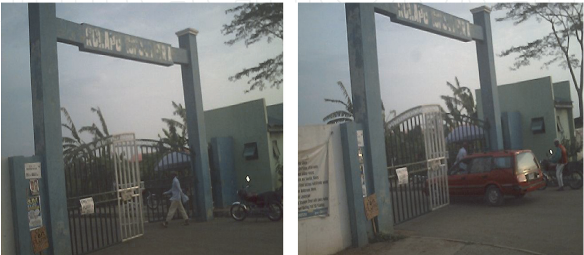
Figure 6. Security gate and guardhouse in kolapo Ishola GRA.