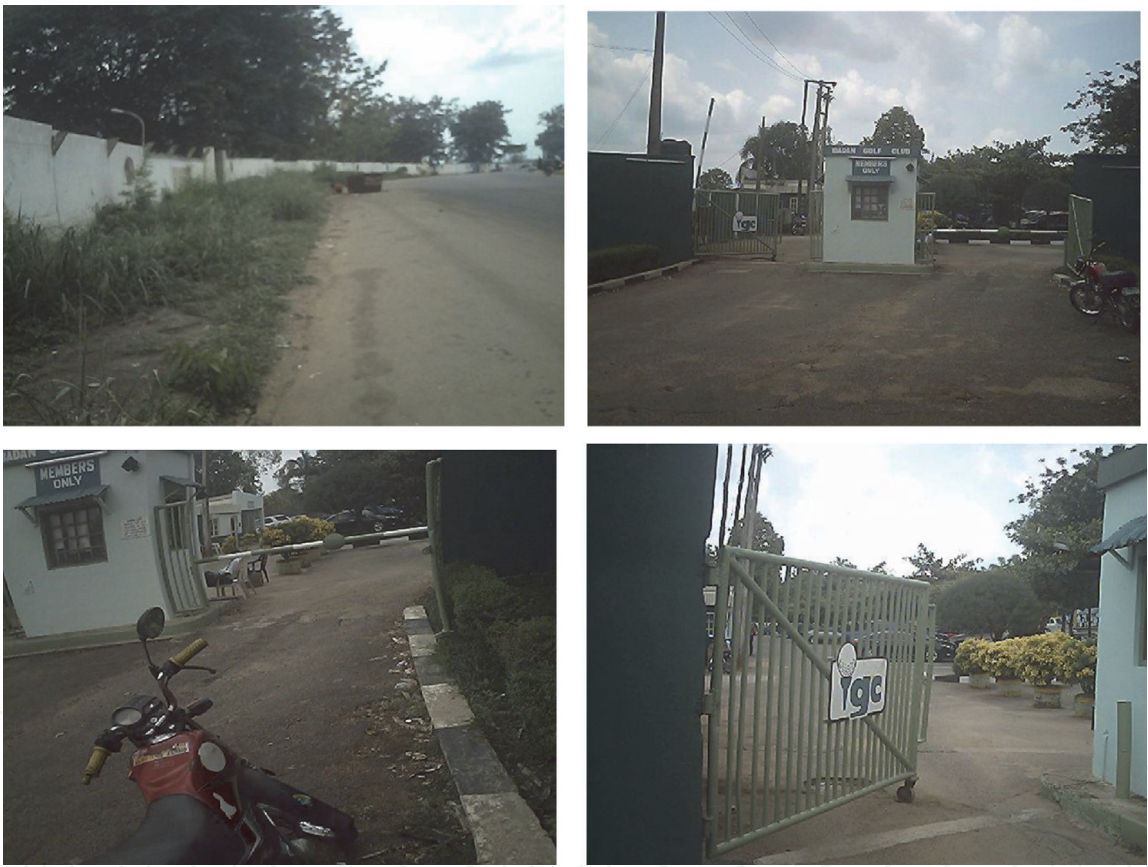
Figure 32. Gate and booms across a road, marking the entrance to an exclusive neighbourhood in Ibadan.

Table 16 combines, the perception of the safety of each of the study areas, and the physical characteristics of the neighbourhoods, namely territoriality, surveillance and milieu. The section discussed the relationship between the perception of safety and the physical characteristics of the neighbourhoods.