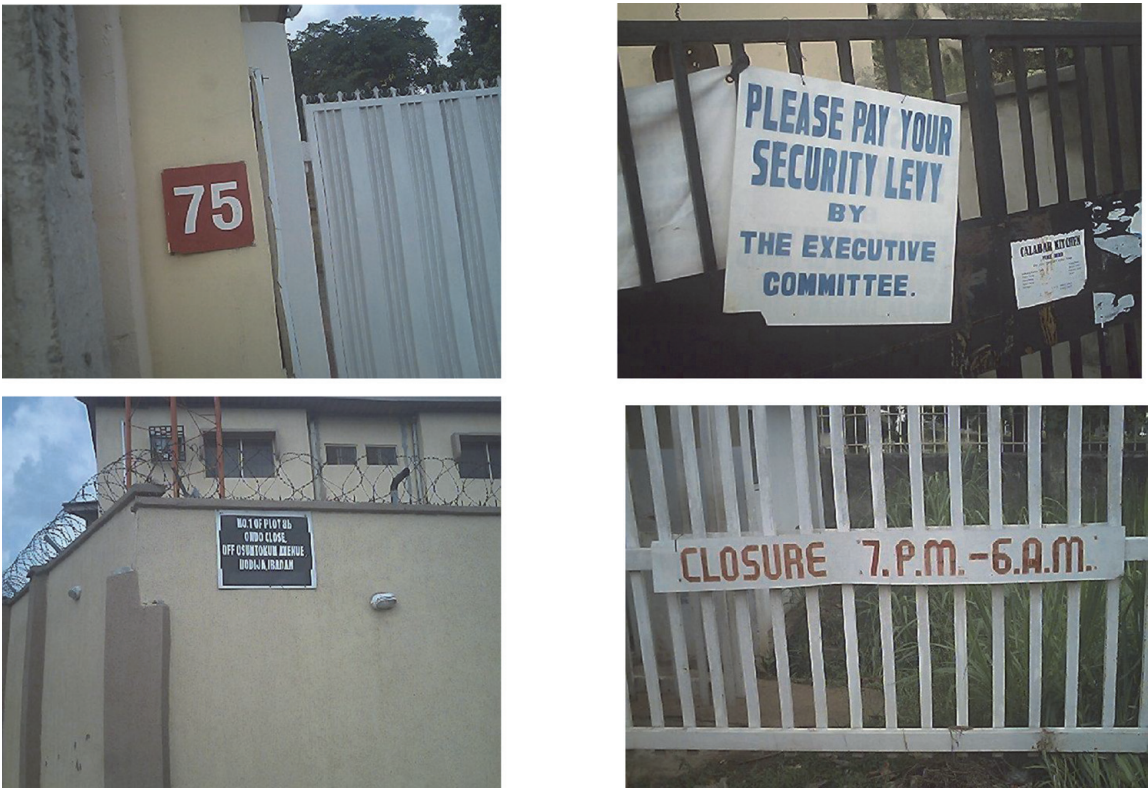
Figure 11. showing an example of signage informing of the closure time. Security levy payment directed by the neighbourhood executive committee and house number.