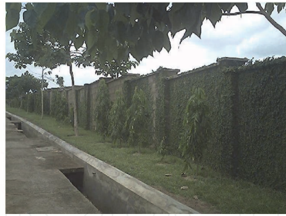
Figure 25. Wall around legacy GC.