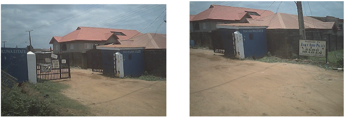
Figure 30. Ogo-Oluwa gate, Agbo area Ibadan.

area), type H (Restricted entry, guarded area), type I (Condominiums). To summarise the physical characteristics of the GCs, it appears OBS has the strongest of these characteristics with an average index of 3.58 as shown in Table 15 while Agodi GRA appears weakest with an index of 2.63.