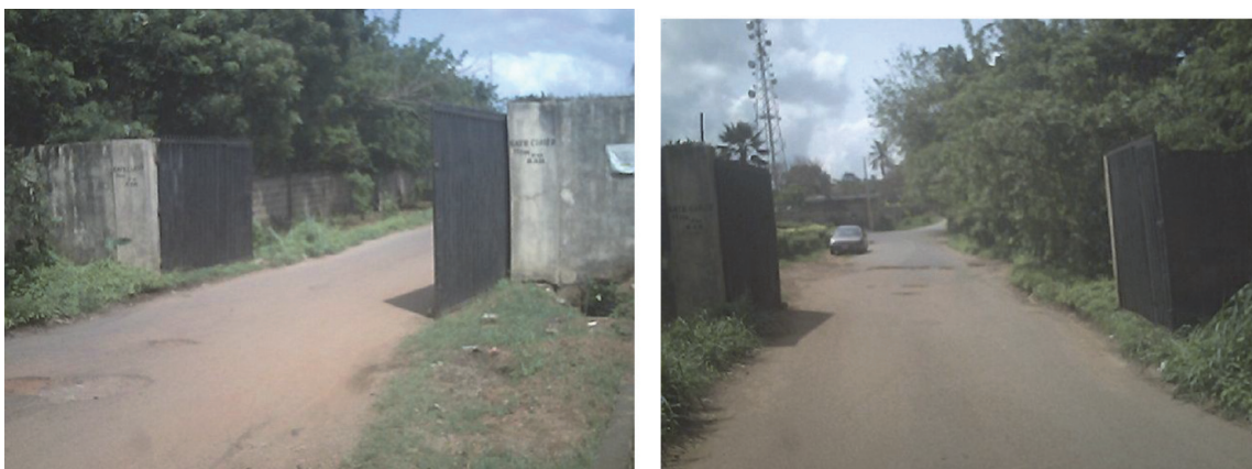
Figure 20. View of one of the exit gate in Agodi GRA.