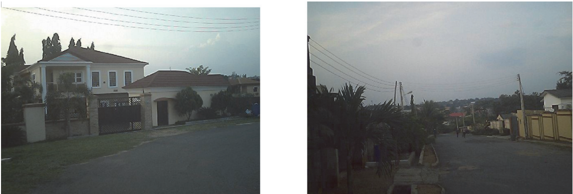
Figure 16. Shows a view of a well-maintained section of ALGRA.