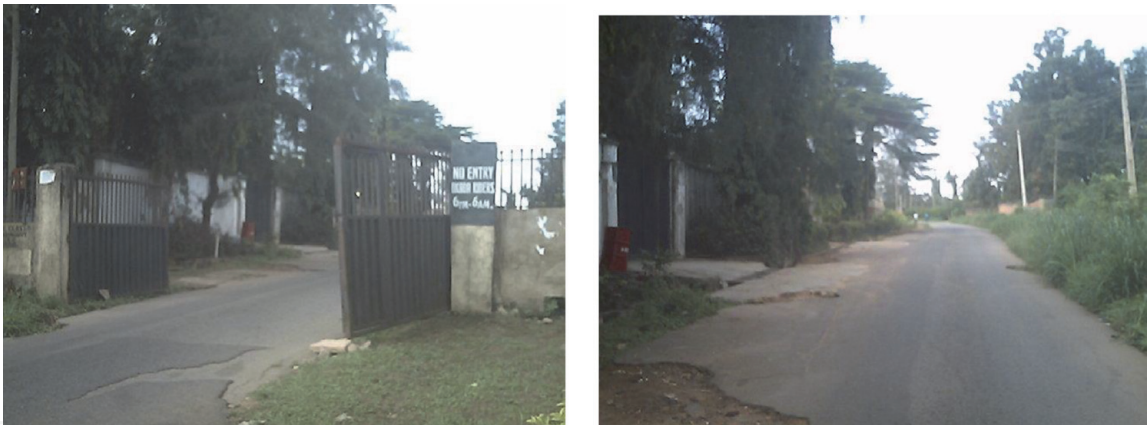
Figure 17. View of the entrance gate and poor road in Agodi GRA CG Ibadan.

Figures 17–20 above show evidence of entrance and exit gate to a closed neighbourhood, poor road, office and unoccupied building with overgrown grass in a neighbourhood in Agodi GRA. Therefore in terms of milieu, OBS seems to be the best having an aggregate index of 3.6 while ALGRA appears to be the least at an index of 1.6.