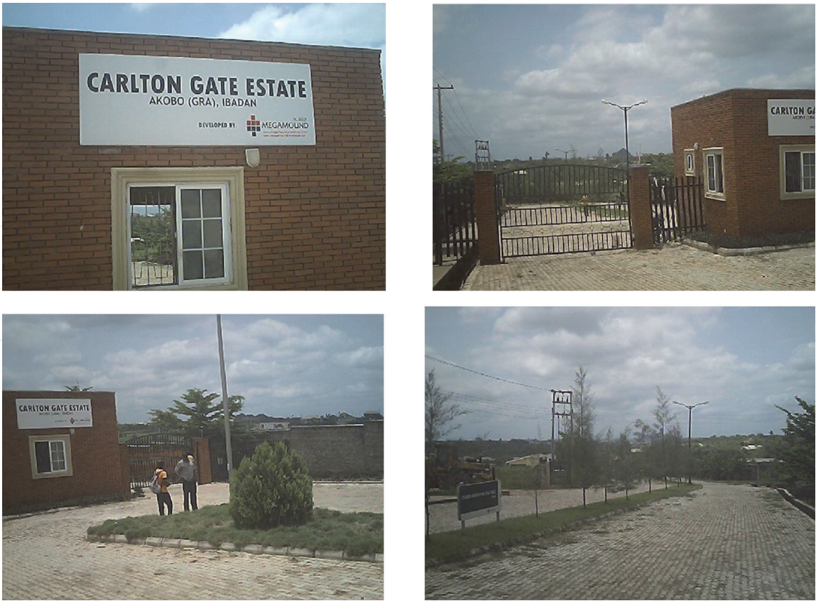
Figure 23. View of Carlton gate estate, Akobo (GRA) Ibadan.