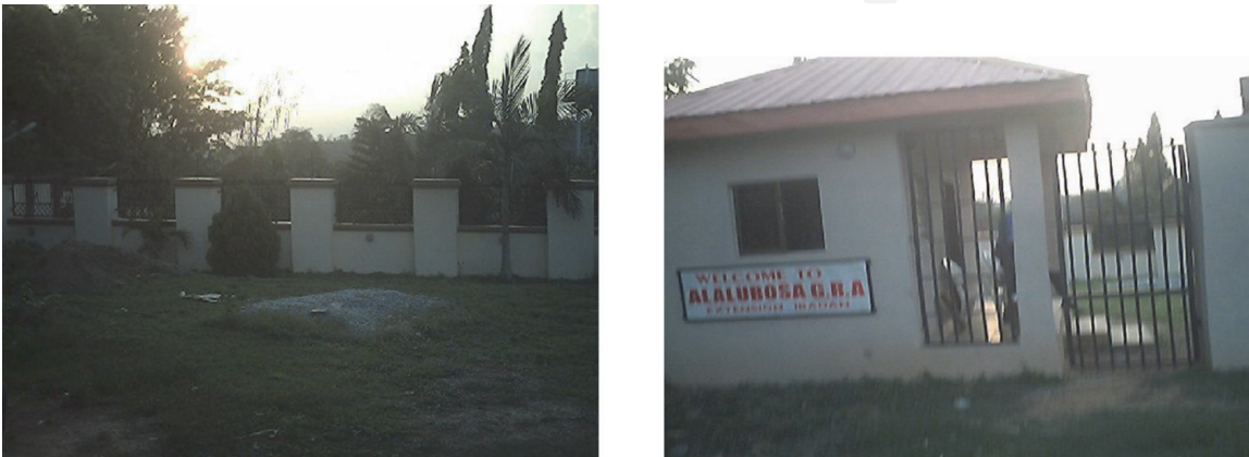
Figure 3. Wall around the GC and the security gate in ALGRA.