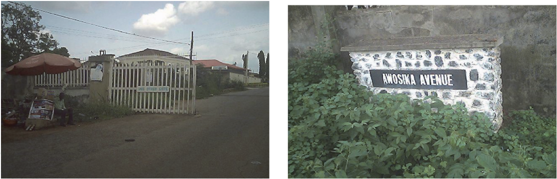
Figure 12. View of the entrance gate and signage in Awosika neighbourhood.