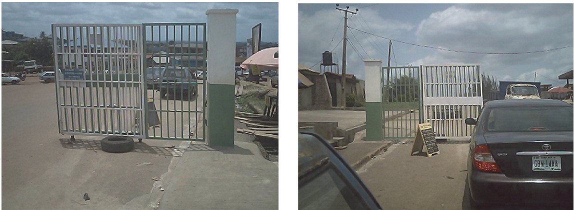
Figure 28. Akala gate, Akobo Ojurin Ibadan.