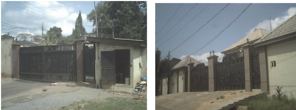
Figure 19. View of the entrance gate and gatehouse to a neighbourhood in Agodi GRA.