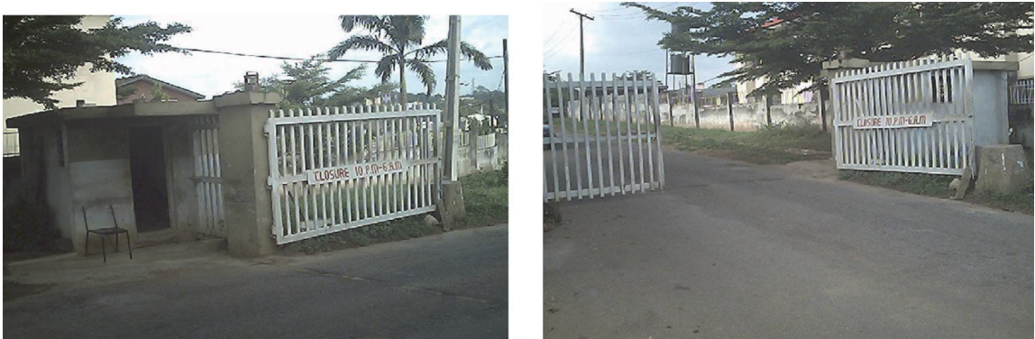
Figure 13. View of exits gate and security guide house in Awosika neighbourhood.