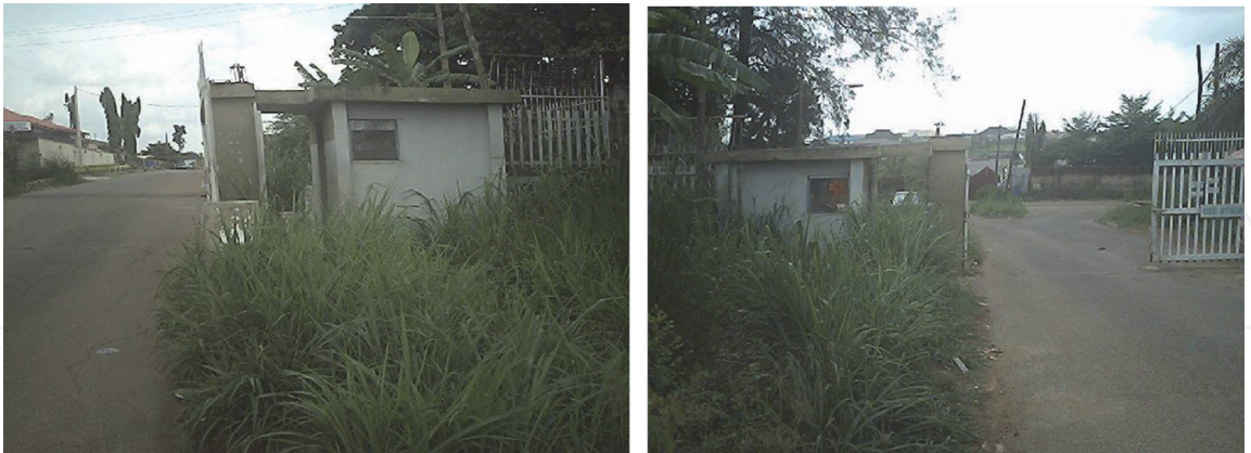
Figure 1. Picture showing the low level of maintenance in the neighbourhood.

shows that perhaps not much effort is invested by the residents in putting signs that define ownership. Figures 2–4 , below show evidence of ownership in ALGRA. As for security signage at the entrance to the areas and neighbourhoods in the study areas, ALGRA seems to be in the forefront with an index of 5.0 while lowest is Agodi GRA with an index of 1.0. For Elements to restrict access ALGRA & KIS seems to have a better usage with an index of 4.0 and the lowest was New Bodija with an index of 1.6.