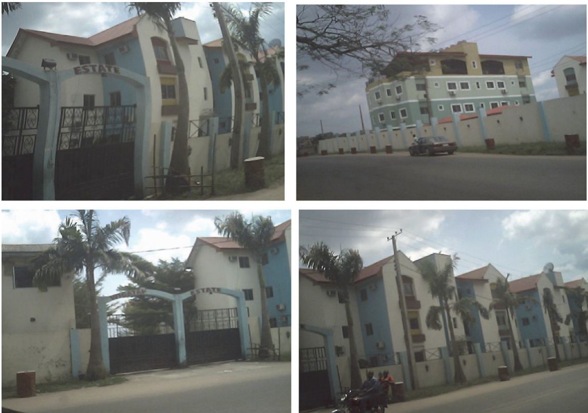
Figure 33. A typical vertical closed condominiums; Wigatar Estate in Sabo Quarters.