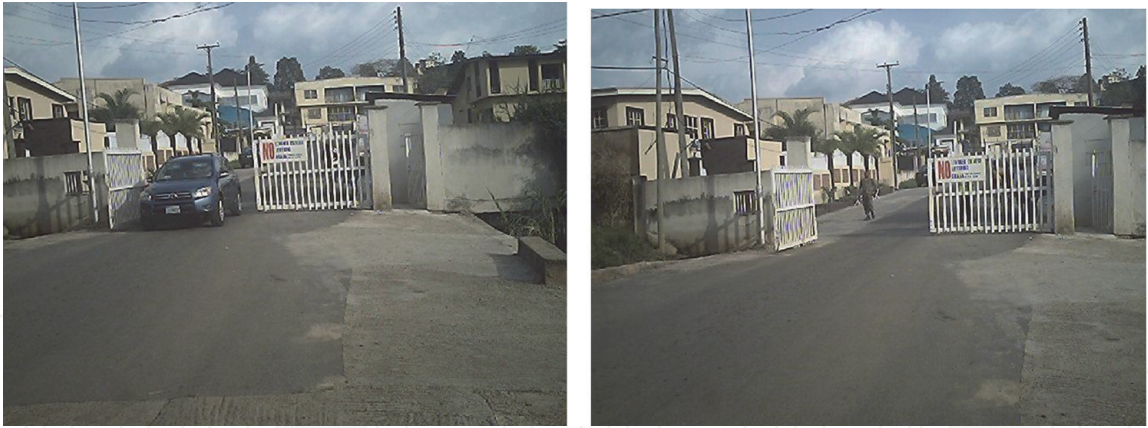
Figure 15. A road closure using a palisade gate at Adeyi neighbourhood, old Bodija.