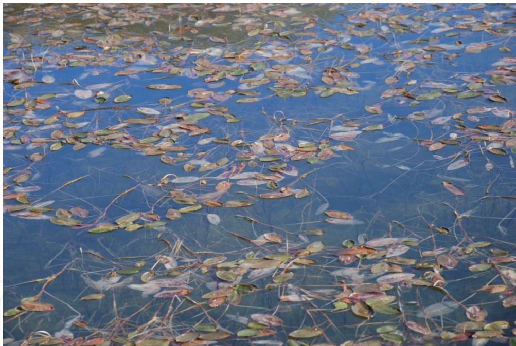
Figure 9. Lacustrine permaseries (Potamogetum natans plant community). Villadangos del Páramo (León, Spain).

stratified, lacking of perennial non-nitrophilous substitution communities. It means that, apart from the annual or ephemeral species and communities that may temporarily establish in the open or degraded spaces of such locations, it is only the perennial plants that participate in the mature community that can thrive to reorganize the same permanent plant community [49] ( Figures 8–11 ).