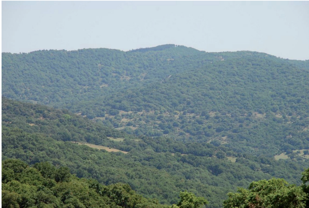
Figure 5. Teucrio baetici-Quercetum suberis , head series of the aljibic climatophilous and acidophilous cork oak forest.