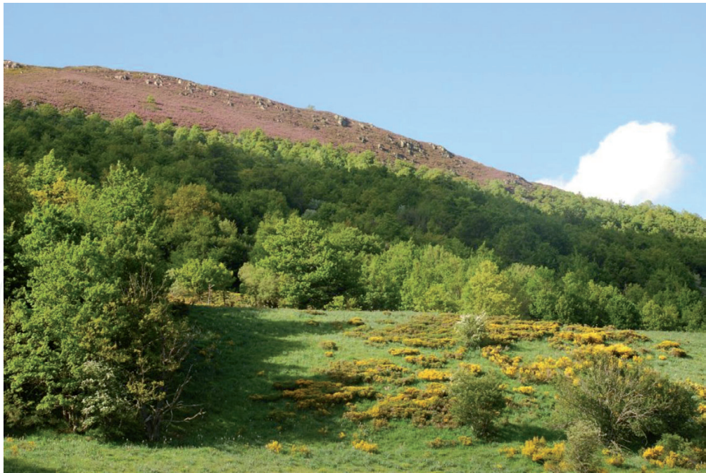
Figure 1. Climax and serial stages of a climatophilous and acidophilous beech forest. Blechno spicant-Fagetum sylvaticae; Cytiso cantabrici- Genistetum polygaliphyllae; Pterosparto cantabrici-Ericetum aragonensis; Merendero pyrenaicae-Cynosuretum cristati. Cofinaal (León, Spain).