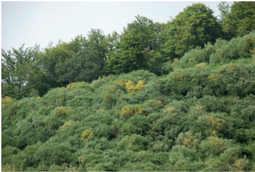
Figure 2. Forest (Blechno spicant-Fagetum sylvaticae) and nanophanerophytic shrubland (Cytiso cantabrici-Genistetum polygaliphyllae). Riaño (León, Spain).

This model or sequence of serial stages is defined as vegetation series in the Dynamic-Catenal Phytosociology. It is also known as sigmetum , sigmeto (Spanishize) or sinassociation . It expresses the entire set of plant communities or steps that can be found in related tessellated spaces (superholotesela) as a result of the process of succession, which includes both the association representative of the mature and series head, like initial or subserial associations that can replace it.