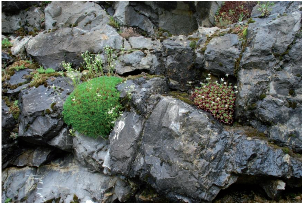
Figure 11. Rupicolous permaseries ( Centrantho lecoqii - Saxifragetum canaliculatae ). Beberino ( León, Spain ).

It is the case of a freshwater lagoon geopermaseries in which the persistence of water is not constant throughout the year. It undergoes partial or total desiccation during the summer because it loses the water table throughout the spring to recover it in autumn and having its maximum during winter ( Figure 12 ).