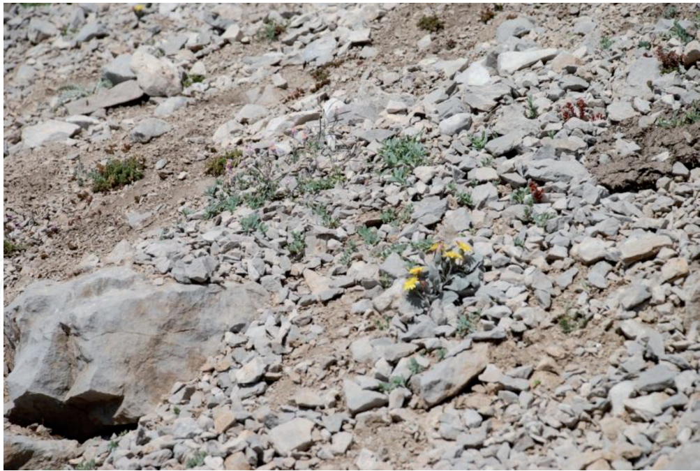
Figure 10. Glericolous permaseries ( Linario filicaulis - Crepidetum pygmaeae ). La Vueltona ( Picos de Europa, Spain ).