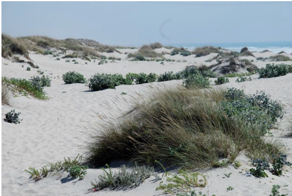
Figure 8. Geopermaseries of dune systems (Ammophiletea australis). Troia Peninsula (Portugal).