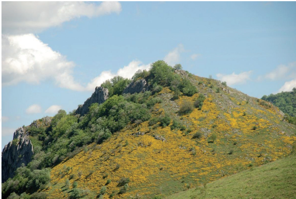
Figure 3. Climax and serial stages of an edaphoxerophilous and basophilous beech forest. Epipactido helleborines-Fagetum sylvaticae, Lithodoro diffusae-Genistetum occidentalis and Helianthemo cantabrici-Brometum erecti. Bernesga Valley (León, Spain).