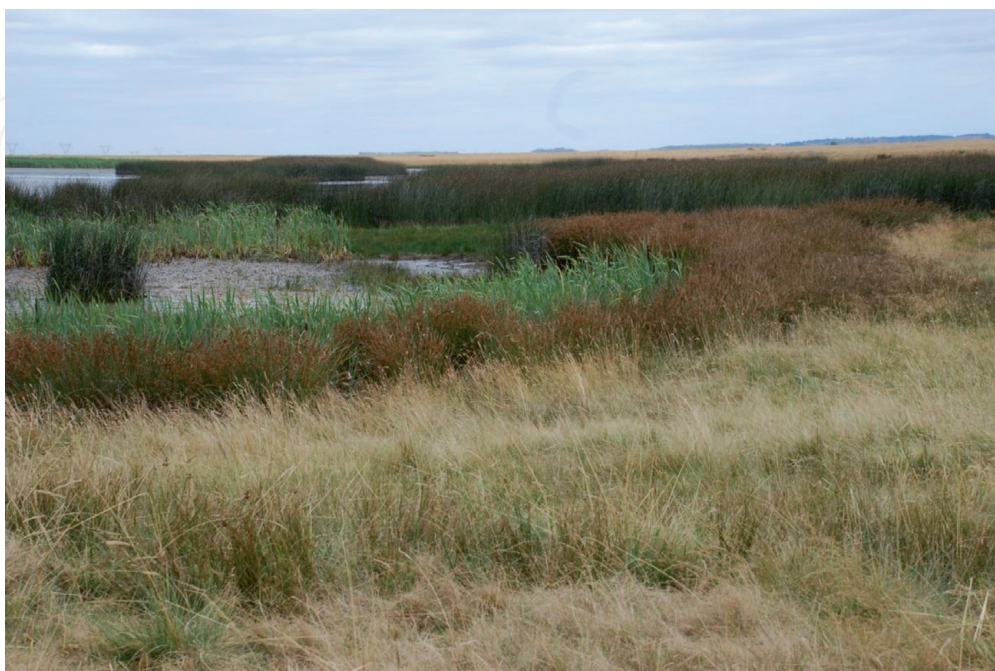
Figure 12. Lagoon geopermaseries. Valdepolo León, Spain.

Let us suppose a beech forest in southern exposure, at the limit of its distribution area between the Eurosiberian and Mediterranean region and therefore in a temperate oceanic bioclimate with a submediterranean variant, that undergoes a regressive