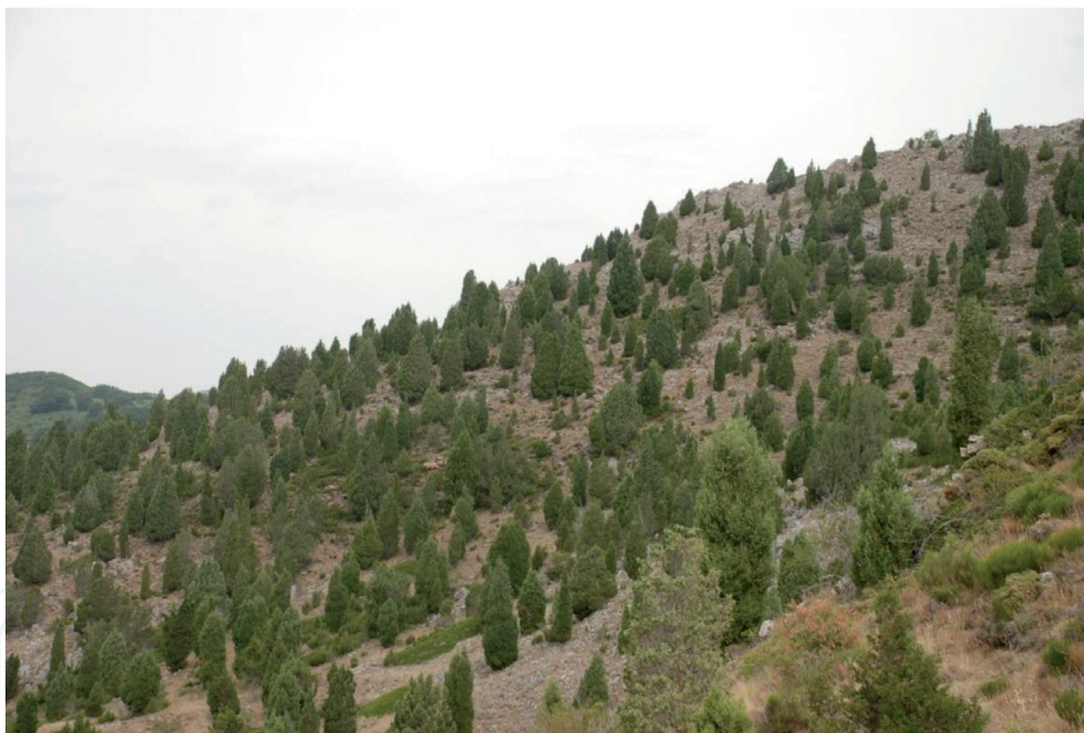
Figure 6. Climax and chamephytic serial stage of an edaphoxerophilous vegetation series. Juniperetum sabino-thuriferae , Lithodoro diffusae - Genistetum scorpii . Mirantes de Luna (León, Spain).

The temporihygrophilous , mesophytic and mesohygrophytic vegetation series have extraordinary hydric contributions due to topographic reasons. These series develop in slightly flooded or very humid soils only part of the year. The soil horizons are well drained or aerated at least during the summer or the dry season.