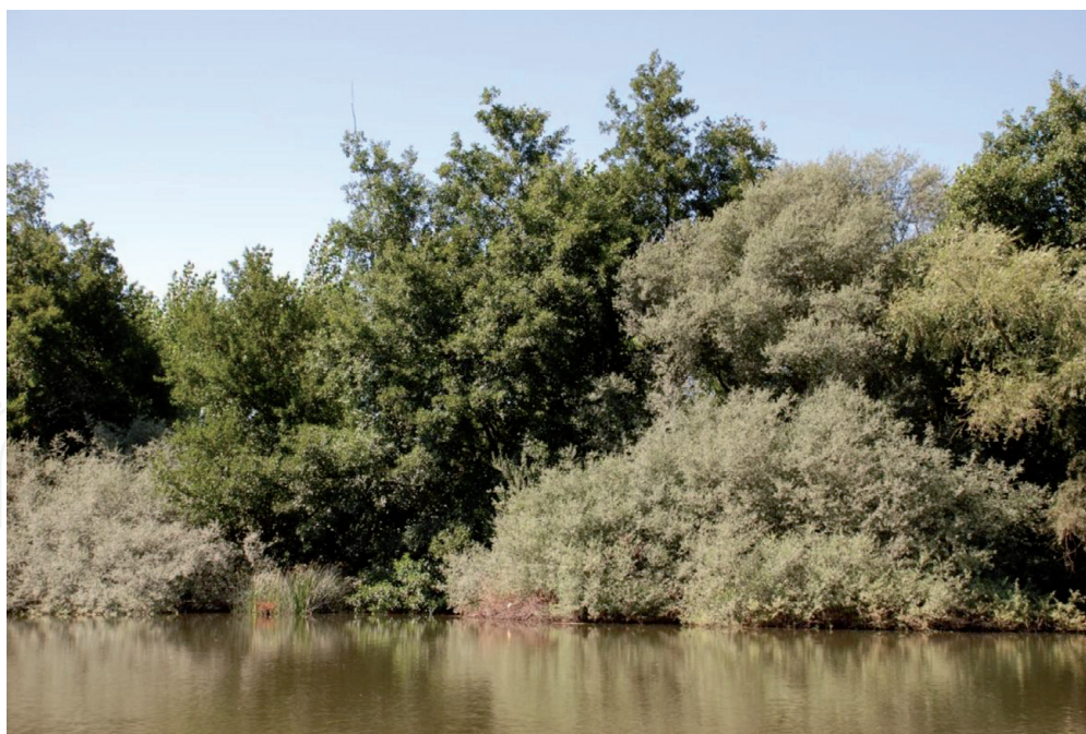
Figure 7. Climax of an edaphohygrophilous vegetation series. Populo nigrae-Salicetum neotrichae . Benavente (Zamora, Spain).

There are other different models apart from the aforementioned vegetation series in the Dynamic-Catenal Phytosociology. Minoriseries of vegetation or minorisigmetum (Latinized expression) are plant communities with their corresponding perennial and annual substitution stages. These are found in the tessellated spaces and in their jurisdictional territories but that by exceptional environmental causes do not reach, in progressive succession, the mature stage of the habitual climatophilous or edaphophilous series head in the corresponding biogeographic and bioclimatic environment.