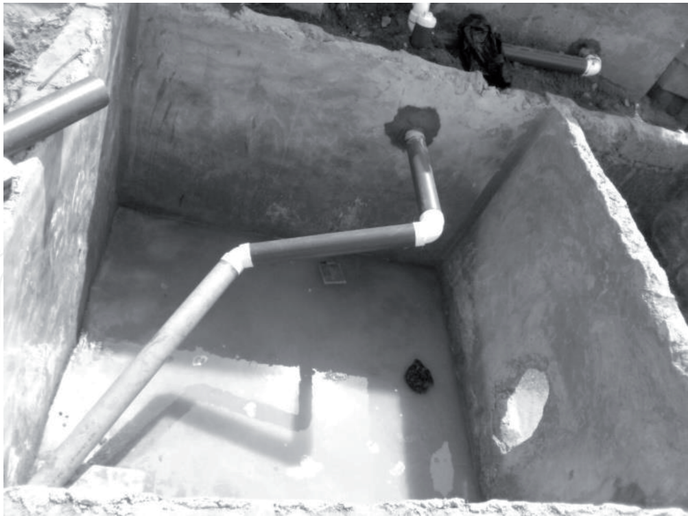
Figure 6. Pipe connections from the pour-flush toilet into the innovative household biogas digester.

systeme, made in EU) via solar cables. The charge controller was connected to a 12 V/30 A/20 Hours offgridtec AGM gel battery series (by offgridtec AGM GmbH, Germany). The battery had a constant voltage charge and voltage regulation with cycle use of 14.5–14.9 V at 25°C and standby use of 13.6–13.8 V at 25°C. The battery was connected to an NP series pure sine wave inverter (Model number NP 300, made by Solartronics, Leipzig-Germany) which had a maximum peak power of 600 W and an average current of 300–400 W. It also had an input voltage of 12 V and an output voltage of 230 V - 50 Hz and efficiency of 84–94% ( Figure 7 ).