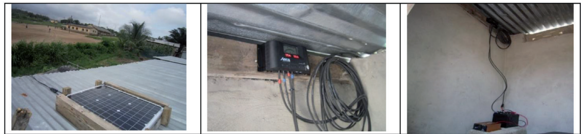
Figure 7. Components of solar-photovoltaic system installed on the biogas digester.

Galvanised copper pipes were used to connect the SSHTABD to the kitchen of the household where potential biogas to be produced was to be used. The copper pipes had diameter of 2 cm. Stop corks or valves were installed at adjoining points to regulate the flow of biogas into a biogas bag to monitor the daily biogas production. The copper pipe was laid into the walls of the restroom to the kitchen at an angle of 45° in order to ensure that all water vapour that could form during the operation of the SSHTABD would trickle down by gravity into a collection tube to be discharged (without losing biogas from the reactor) ( Figure 8 ).