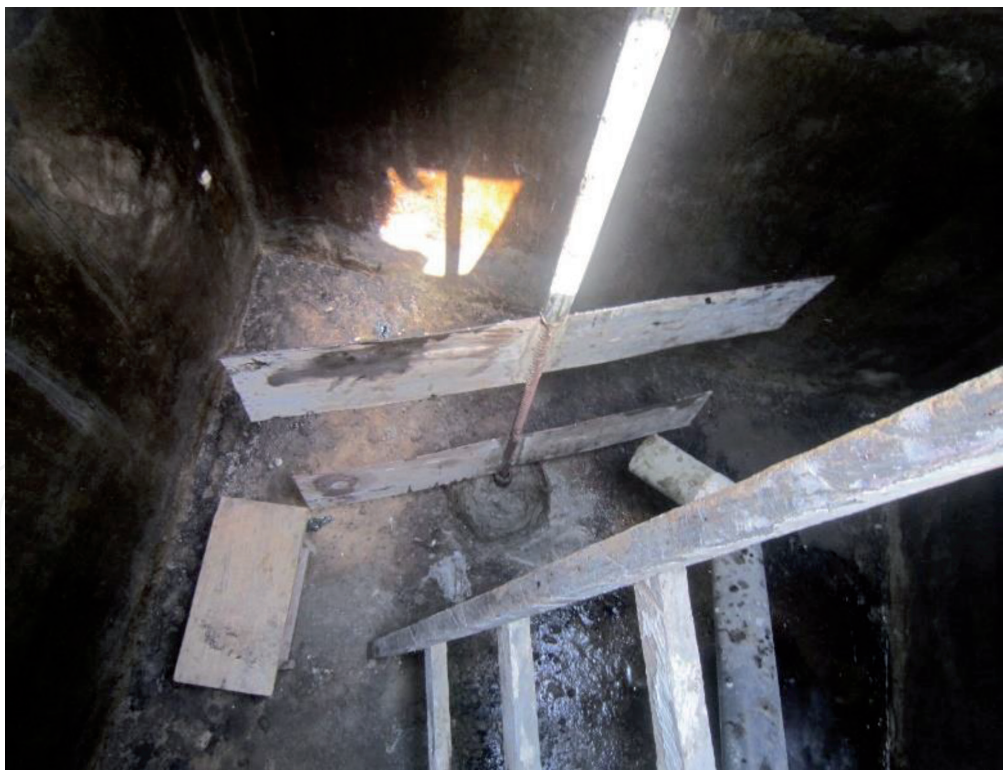
Figure 4. Manual stirrer in the biogas digester.