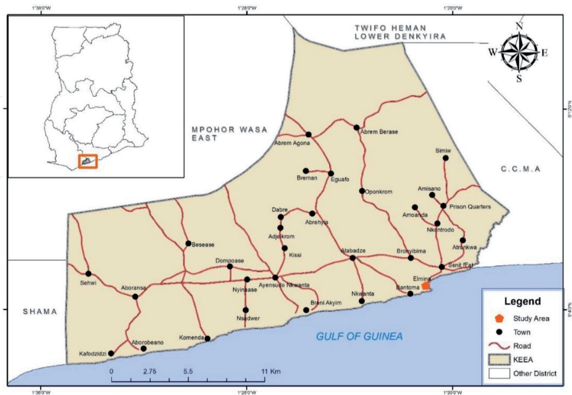
Figure 2. Map of Ghana showing the district map of the study area, Elmina.

The construction of a household biogas digester connected to a household toilet facility was imperative to help curb the issue of open defecation in the slum due to