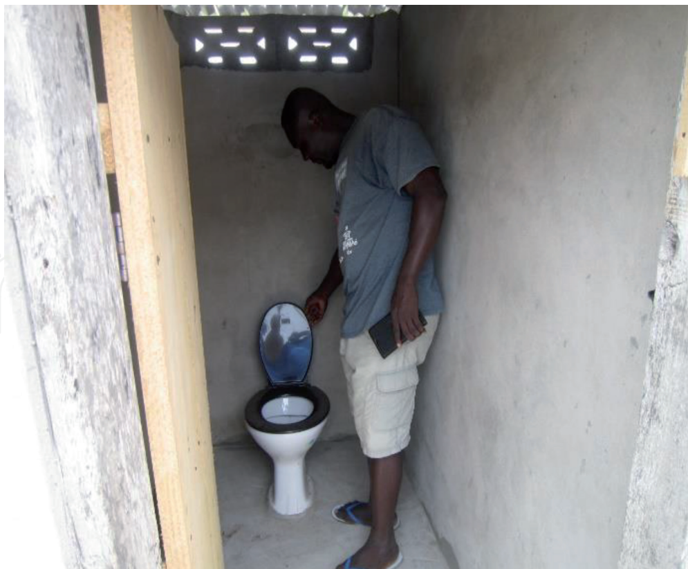
Figure 5. A 3-litre pour-flush toilet seat connected to the biogas digester.

connected using 4-inch Tee, 4-inch 45° and 4-inch 90° pipes. The influent pipe was inserted into the reactor to a depth of 450 mm above the floor of the reactor. This was done to ensure that the influent fully covered the pipe to avoid any biogas leakage through the influent pipe. An inlet pipe with a cover was also connected to the influent pipe carrying faecal materials to enhance co-digestion processes ( Figure 6 ).