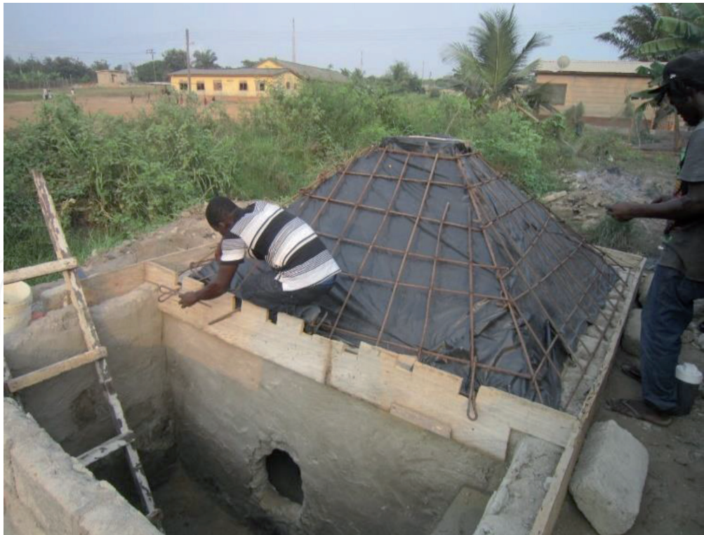
Figure 3. Construction of a pyramidal-shape biogas digester insulated with black polythene bag.