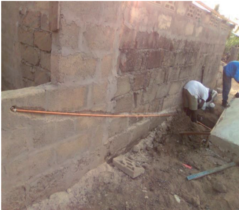
Figure 8. Installation of galvanised copper pipes for tapping biogas into kitchen.