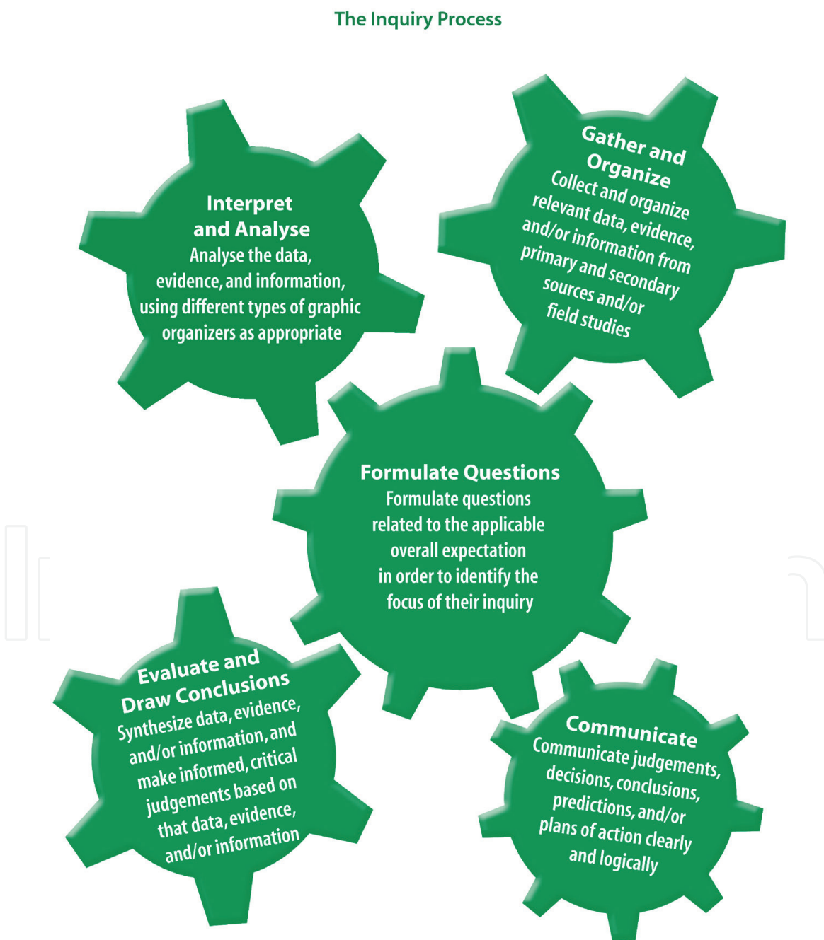
Figure 2. The inquiry process ([11], p. 24)

The five components include: formulating questions, gathering and organizing information, interpreting and analyzing information, evaluating information and/or evidence, and communicating findings ([11], p. 23). The figure provides several