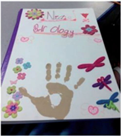
Figure 5. A Selfology cover ([33], p. 171).

an explicit critical re-reading of who is in a family. Other pages in the Selfology included an interview with a relative, a timeline highlighting significant life events, and a self-portrait (see Figure 6 ).