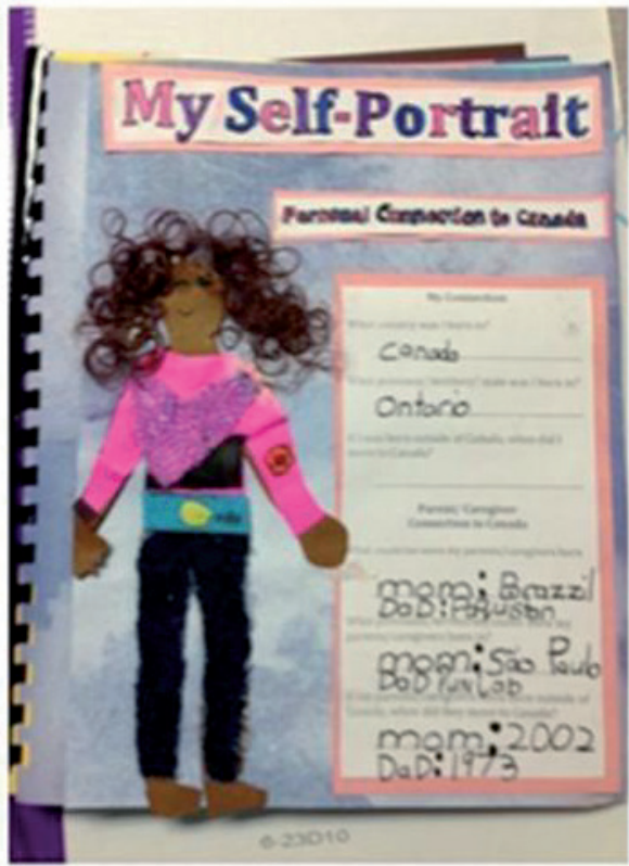
Figure 6. The self-portrait page of the Selfology ([33], p. 173).

The purpose of the self-portrait was to build affirmation of identity in young children; to have children recognize that each person is different and unique and that everyone is special. Furthermore, students were guided to discuss that in Canada all people, unless they are First Nations, Métis, or Inuit, come from another country. A sense of the self and the Other was central to the learning and to the process of developing an understanding of identity central the development of responsible, active citizenship. Ultimately, the six-week unit of study brought forward a high degree of