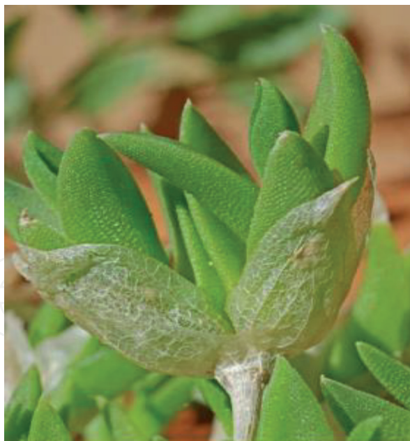
Figure 1. Sceletium plant and its “skeletonised appearance” of the dried leaves [1].

increases its stimulating effect. The plant is native to South Africa, where it is well known by the indigenous people, especially in Namaqualand, where the plant is utilized regularly for its medicinal and anti-depressant properties [2].