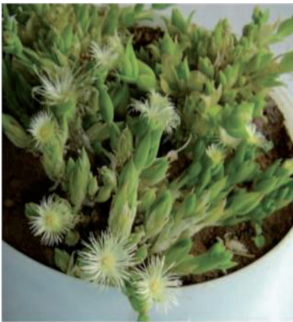
Figure 2. Sceletium tortuosum plant surrounded by its white flowers [13].

Within the family Aizoaceae Martinov. there are currently four sub-families, namely Sesuvioideae, Aizooideae, Ruschioideae, and Mesembryanthemoideae [10, 11]. Succulent plants within the Aizoaceae family are popularly termed “Mesembs”, and sometimes placed in their own family, the Mesembryanthemaceae [2]. Common terms used to describe this group of succulent plants are vygies, fig-marigolds, flowering-stones, ice plants and, midday flowers, among others. These plants fascinate many plant enthusiasts and have become popular collector’s items due to their remarkable variation in leaf architecture, flower color and form, and fruit structure ( Figure 2 ). Different genera within the family grow in various habitats, and examples can thus be found growing in rocky crevices, silty flats and in saline wastelands. Mesembs occur mainly in south-western Africa, including Angola, South Africa, Zimbabwe, Botswana and Namibia [2, 12] ( Figure 3 ).