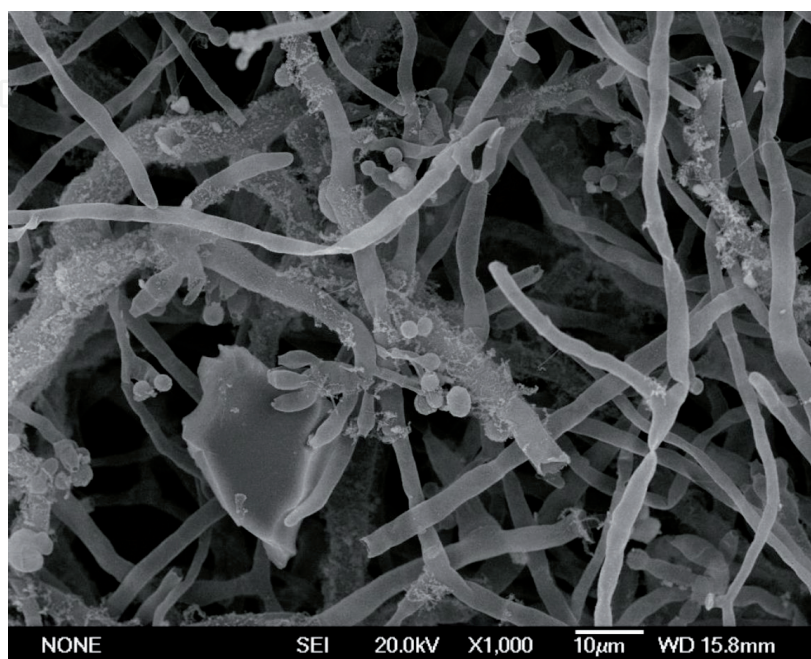
Figure 3. SEM image of the fungus Aspergillus niger grown on fluorescent lamp powder.

Electronic wastes are discarded devices that are at the end of their economic use and cannot be utilized by consumers anymore. The total global e-waste generation in 2021 is expected to achieve 52.2 Mt. The biggest economic interest is focused on gold with 50% of the possible revenue, but e-wastes contain other metals in significant amounts and still worth to be recovered. Investigations on bioleaching associated to printed circuit boards (PCB) recycling has mostly centered on copper and gold recovery. Ferric iron generated by iron-oxidizing bacteria is involved in