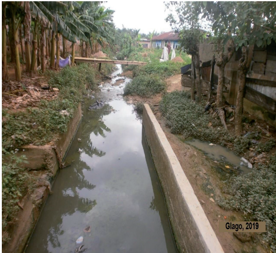
Figure 1. Showing a partially completed drain in the Asamankese community, Eastern region of Ghana.

closely related to the depth of inundation of floods water. The extent of a flood has a direct relationship for the recovery time of crops, pastures and the social and economic dislocation impact to populations. The impact of floods is considered far reaching with the aftermath effects such as flood-induced disease epidemics. Disease outbreak is common, especially in less developed countries. Malaria, Typhoid and Cholera outbreaks after floods in tropical countries are also common [17]. [9] further stated that physical damage to property is one of the major causes for tangible loss in floods. This includes the cost of damage to goods and possessions, loss of income or services in the floods aftermath and clean-up costs. Some impacts of floods, on the other hand, are intangible and are hard to place a monetary figure on. Intangible losses also include increased levels of physical, emotional and psychological health problems suffered by flood-affected people.