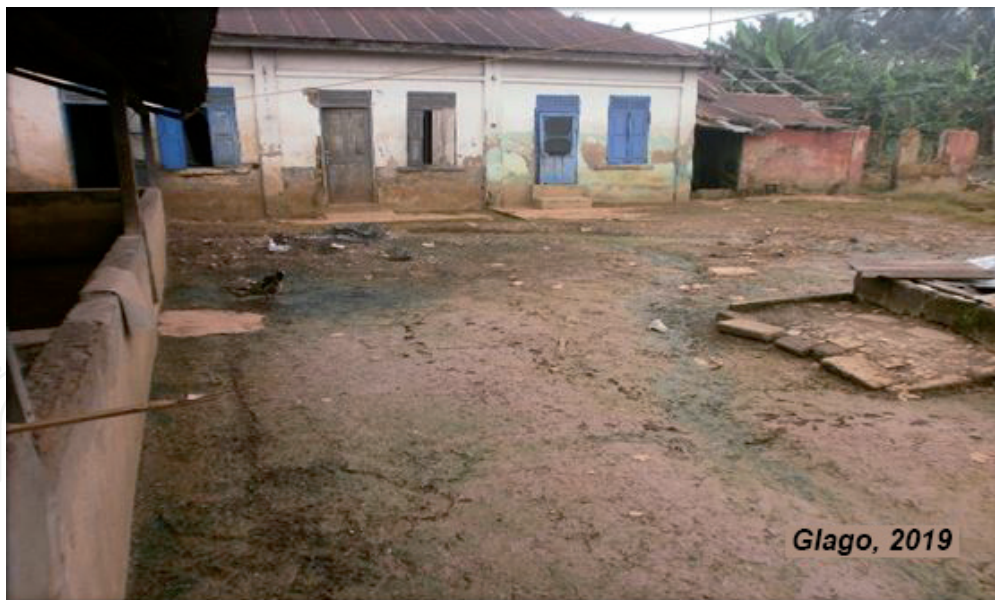
Figure 2. Depicting the impact of flood events on residents' household in Asamankese, Eastern region of Ghana.

tend to hit communities in developing and least developed countries more. Flood disasters have led to the loss of human life, destruction of social and economic infrastructure and degradation of already fragile ecosystems [20]. It follows therefore that social impacts include changes in people's ways of life, their culture, community, political systems, environment, health and wellbeing, their personal and property rights and their fears and aspirations.