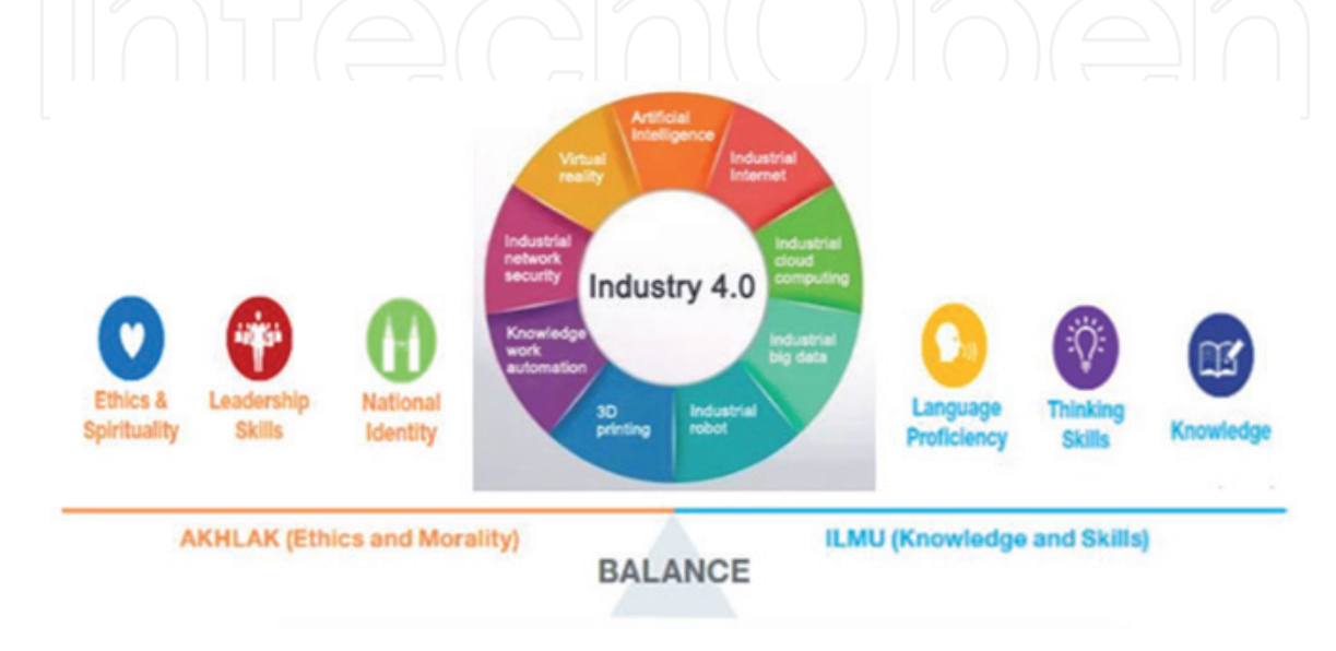
Figure 2. The 21st century curriculum for MyHE 4.0.

Hence, it is suffice to state that presently educational system in Malaysia is bracing for new paradigm shift or at a lesser extent enhancing the existing methods to ensure that entrepreneurial learning content is aligned with impacts of 4IR. Although the Education 4.0 Framework that address the issues and challenges