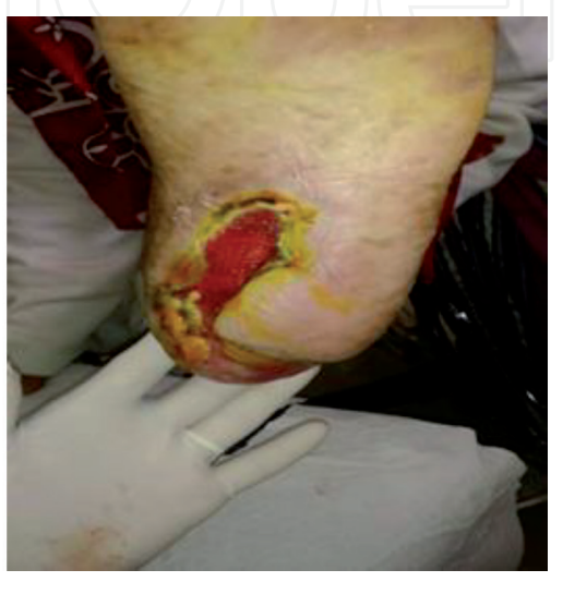
Figure 3. Wet gangrene of the forefoot complete healing under antibiotic treatment and MMP's inhibitor (pharysor).