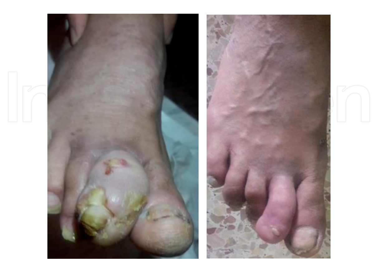
Figure 1. Wet gangrene of the toe with osteitis. Complete healing under antibiotic treatment and MMP's inhibitor (pharysor).

Dressing materials can be of various categories including natural, modified and synthetic polymers, as well as their mixtures or combinations, processed in the