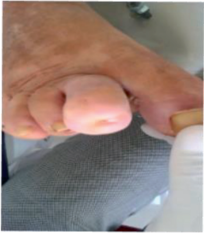
Figure 2. Wet gangrene of the second toe with osteo-arthritis. Complete healing under antibiotic treatment and MMP's inhibitor (pharysor).