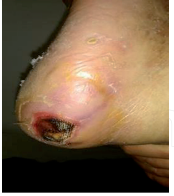
Figure 4. Gangrene with osteitis of the calcaneus complete healing under antibiotic treatment, excision and MMP's inhibitor (pharysor).