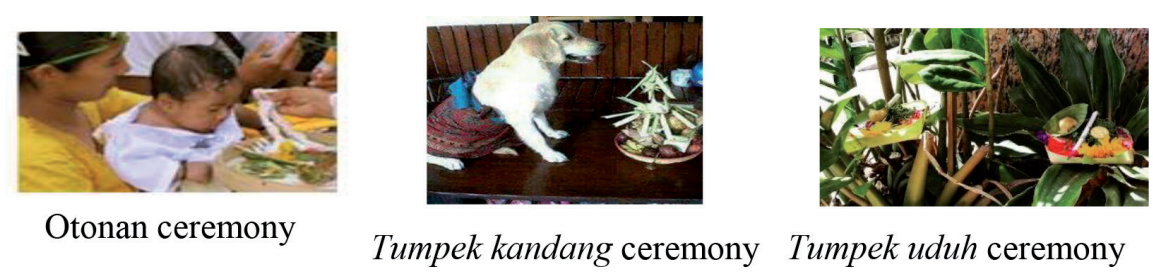
Figure 1. Ceremonies to humans, animals, and plants.

Table 3 explains that sustainable tourism implemented in Bali focuses on four benefits. First, economic benefit that will influence behavior, politics, and community economic activities. The condition could be observed from purchasing power,