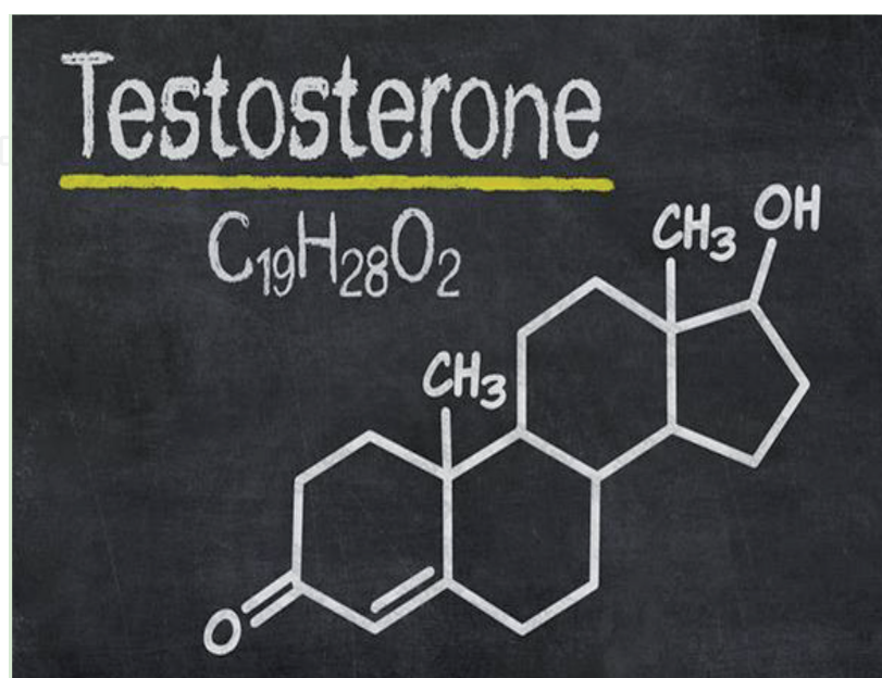
Figure 2. Chemical structure of testosterone [5].

Generally speaking, in vivo, testosterone is converted into dihydrotestosterone (DHT) in the target tissues irreversibly by the enzyme 5-alpha reductase. The testosterone or DHT ligand-androgen receptor complexes then act as transcription factor complexes. In this way, it stimulates the expression of various responsive genes. In comparison, DHT binds with higher affinity to androgen receptors than testosterone, thus activating gene expression more efficiently. Testosterone, in addition, is irreversibly converted to estradiol by the enzyme complex aromatase. This occurs particularly in the liver and adipose tissue. Both testosterone and DHT promote the development and maintenance of male sex traits related to the internal and external genitalia, skeletal muscle and hair follicles. On the other hand, estradiol promotes epiphyseal maturation and bone mineralization. However, because of rapid metabolism by the liver, therapeutic testosterone is generally administered as an ester derivative (Figure 2) [11].