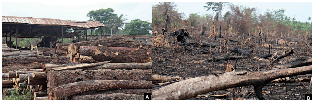
Figure 3. Major caused of depleting plant resources in the Sahel region. (a) Demand for timber and (b) bush fire.