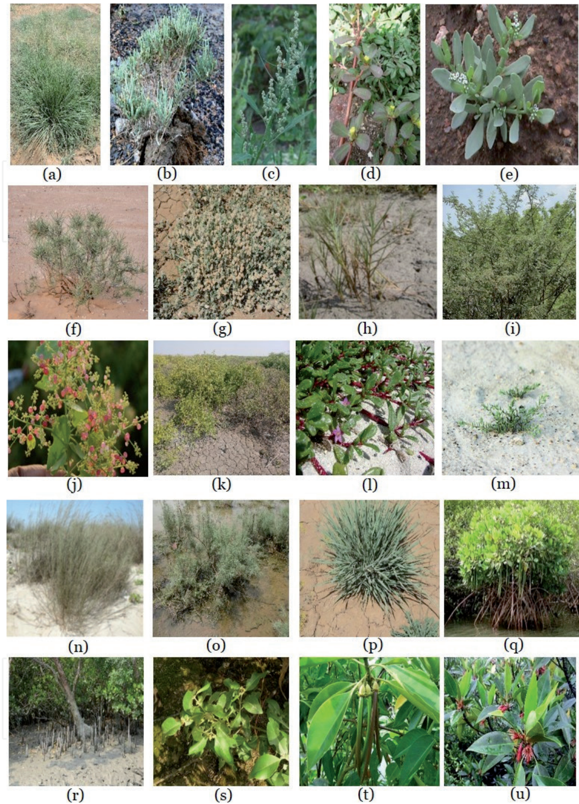
Figure 1. Major halophytes and mangroves found in India. (a) Sporobolus marginatus , (b) Salicornia brachiata , (c) Chenopodium album , (d) Portulaca oleracea , (e) Heliotropium curassavicum , (f) Haloxylon salicornicum , (g) Cressa cretica , (h) Aeluropus lagopoides , (i) Prosopis juliflora , (j) Salvadora oleoides , (k) Salvadora persica , (l) Sesuvium portulacastrum , (m) Suaeda fruticosa , (n) Halopyrum mucronatum , (o) Tamarix spp, (p) Urochondra setulosa , (q) Rhizophora mucronata , (r) Heritiera fomes , (s) Avicennia marina , (t) Bruguiera cylindrical , (u) Bruguiera gymnorrhiza .