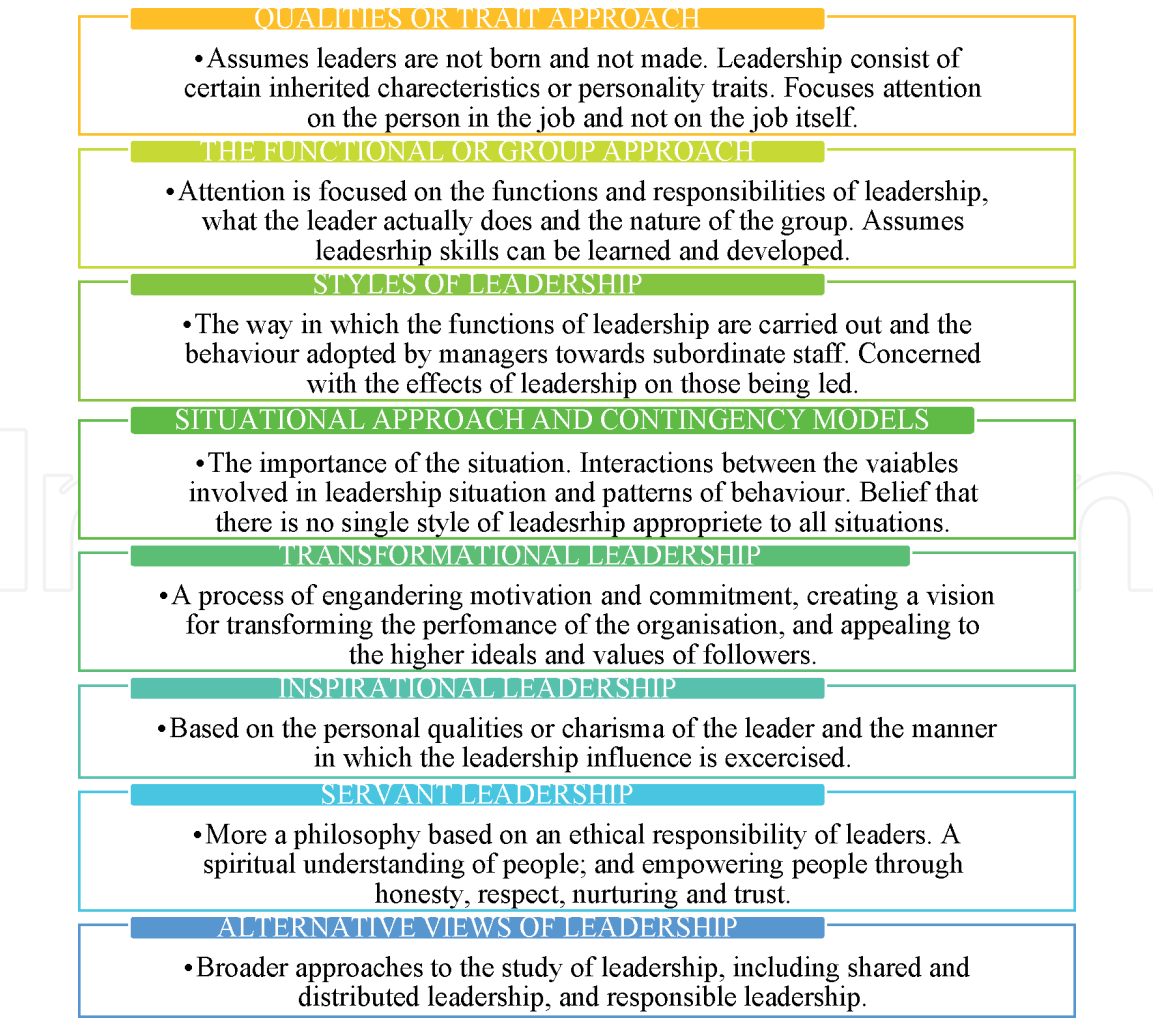
Figure 1. Framework for study of managerial leadership.

There are common themes about the nature of leadership and leaders captured in every continent in the context of politics, the military, philosophy and businesses. Research literature on tourism reveals that leadership has not received the necessary attention in both tourist destinations and networked environments in general [39]. The work by [28] covers tourism and environmental degradation in China, while Zhang, Khan, Kumar, Golpîra, and Sharif covered logistical