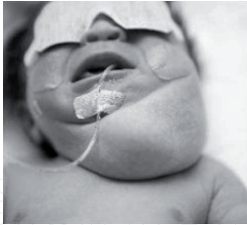
Figure 8. Huge movable mass is found out on the left neck [44].

facilitate intubation has been reported but at the expense of complicating further the surgery. Post-operative intensive care (PICU) monitoring is indicated for high-risk lesions [45, 46].