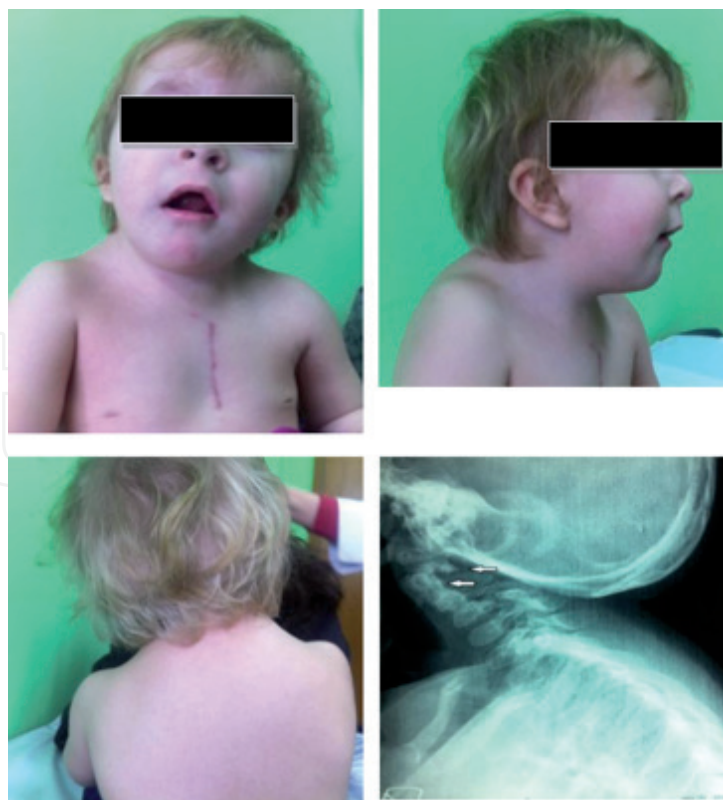
Figure 6. Child with Klippel-Feil syndrome and anomaly of the Occipito-cervical junction. The images show an elevated left shoulder due to a Sprengel anomaly, a short, webbed neck, and a low hairline (scar on the thorax after surgical repair of nonrestrictive atrial septal defect) [37].

hyperlaxed spines who may require C-spine precautions with in-line-stabilization during intubation. This is performed via a lateral neck X-ray in flexion and extension positions [1, 4–7].