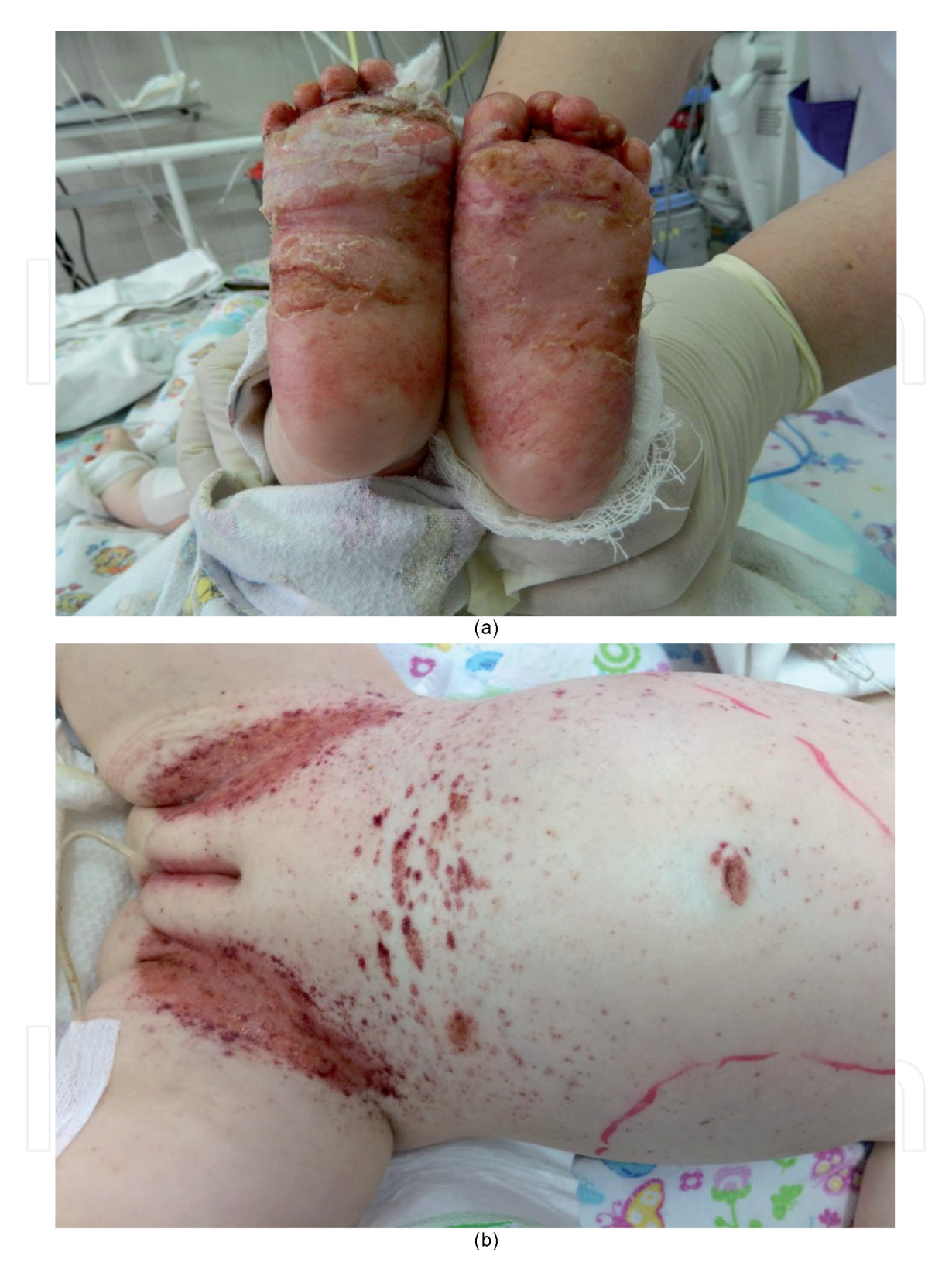
Figure 2. Dynamics of skin changes: foot skin lesion (a) and inguinal areas (b).

the girl was on the mechanical ventilation of lungs for 10 days. The condition of the second child remained stably severe.