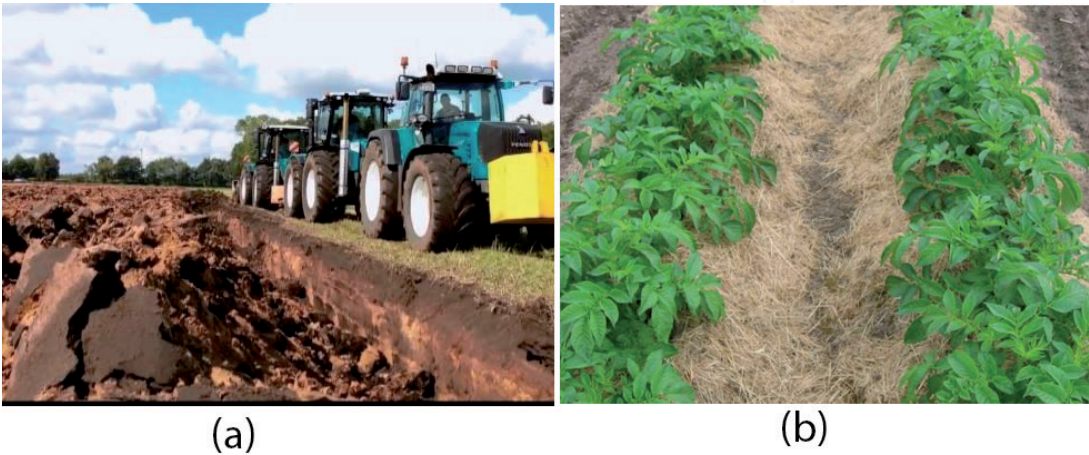
Figure 1. Physical management practices of salinity management: (a) deep ploughing and (b) mulching.