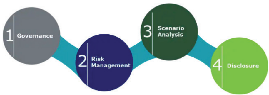
Figure 4. Elements of climate-related risk management [60].

management frameworks to address financial risks from climate change, in line with their board-approved risk appetite. Firms should identify, measure, monitor, manage, and report on their exposure to these risks to their stakeholders. Material exposures should be included in their Internal Capital Adequacy Assessment Process (ICAAP) or Own Risk and Solvency Assessment (ORSA). Where appropriate, the PRA expects firms to consider a range of quantitative and qualitative tools and metrics to monitor their exposure to financial risks from climate change. Firms should provide evidence of how material risks will be mitigated and have credible plans or policies to manage these exposures. The management information should enable the board to discuss, challenge, and take decisions relating to the firm's management of the financial risks from climate change. Scenario analysis should also be used to explore the resilience and vulnerabilities of a firm's business model to a range of outcomes, based on different transition paths to a low-carbon economy, as well as a path where no transition occurs. Disclosures should be as insightful as possible, reflecting the firm's evolving understanding of the financial risks from climate change ( Figure 4 ) [60].