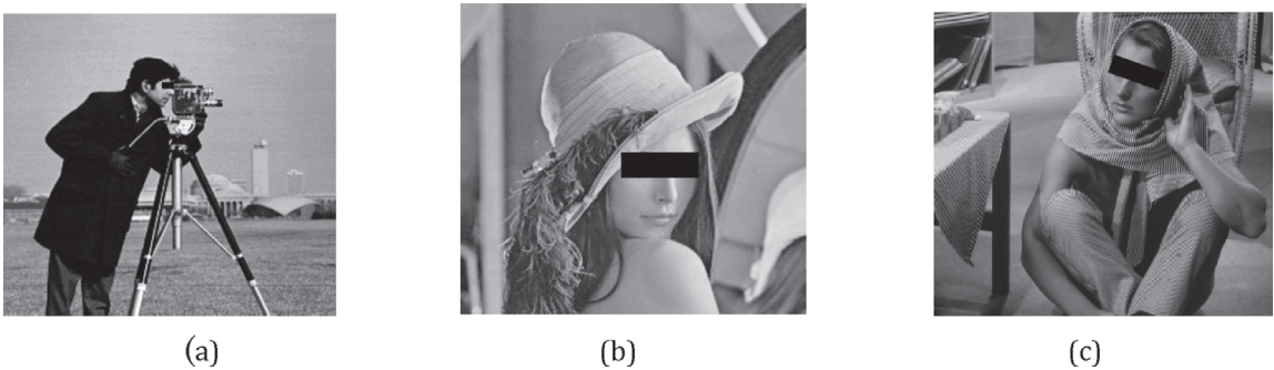
Figure 1. Tested images (before compression). (a) Cameraman, (b) Lena, and (c) Barbara.

The table below presents the results obtained by applying our approach to the above images with different resolutions: