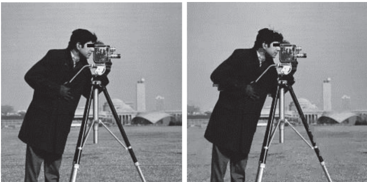
Figure 4. An image of compressed and decompressed cameramen.