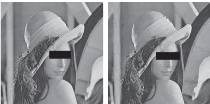
Figure 5. An image of compressed and decompressed Lena.