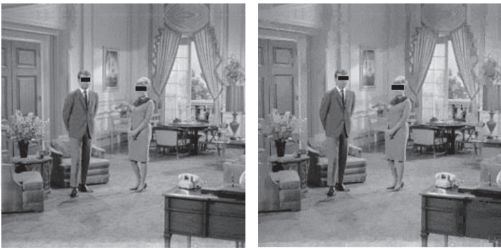
Figure 6. An image of compressed and decompressed living room.

The table shows that our approach is significantly sensitive to changing resolutions. It is also clear that the quality of the images is inversely linked to the resolution (as soon as the resolution increases, the quality of the images degrades) which is well proven by the MSE and PSNR measurements.