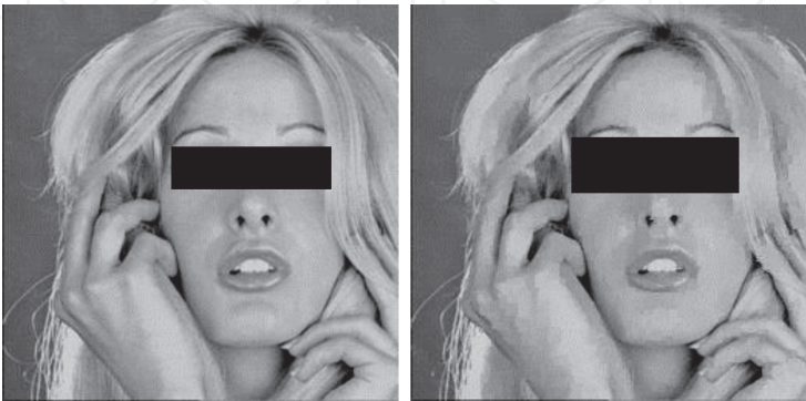
Figure 3. An image of Compressed and decompressed blond women.

And to approve this effect, Table 6 explores additional quality measure.