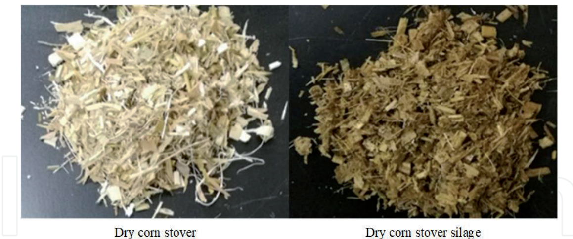
Figure 3. The surface morphology of the starting material and the resulting silage.