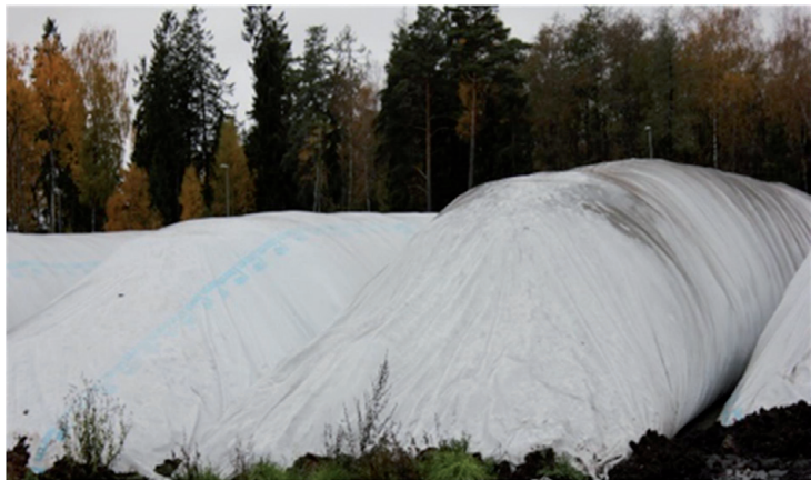
Figure 2. Large-scale storage in movable microbial ensilage membranes.

The goal of good fermentation is to maximize the production of lactic acid, thereby reducing the pH value and establishing an environment that is not suitable for the growth of harmful organisms. Good silage is made with less exposure to the air, allowing the Lactobacillus to start fermenting quickly. For example, modern biogas engineering adopts the following pretreatment devices to complete the anaerobic fermentation process ( Figure 2 ).