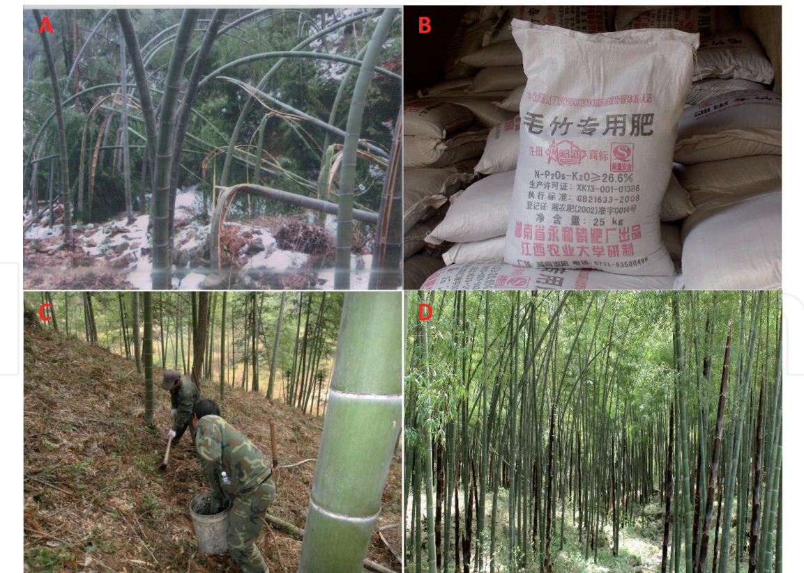
Figure 3. The College of Forestry, Jiangxi agricultural university, has developed the special fertilizer for Phyllostachys edulis to guide the reconstruction after freezing disaster, precision fertilization, and intensive nutrient management. Notes: (A) the Phyllostachys edulis forest suffered from freezing disaster; (B) the special formula fertilizer for Phyllostachys edulis ; (C) Farmers apply special fertilizer for Phyllostachys edulis ; and (D) after precision fertilization and intensive nutrient management, the growth of Phyllostachys edulis forest was exuberant.

In recent years, the forest fertilization research team of Jiangxi Agricultural University has also carried out research on balanced fertilization technology and formula of Eucalyptus robusta , Evodia rutaecarpa , Ziziphus jujuba , Cunninghamia lanceolata , and other tree species, meeting the needs of Jiangxi forestry production [66]. The vegetation restoration of rare earth mines in South Jiangxi relies on good nutrient management technology, which makes afforestation of barren wasteland successful [67]. The related research results include: (1) establishing the indicators of soil nutrient abundance and deficiency and leaf nutrient diagnosis (critical value) of economic forest species such as Phyllostachys edulis ( Figure 3 ), Camellia oleifera , Eucalyptus robusta ( Figure 4 ), and Evodia rutaecarpa , which provide the basis and scientific basis for the diagnosis and balanced fertilization of main economic forest species in Jiangxi Province; (2) based on this, the balanced fertilization formula for Phyllostachys edulis and Camellia oleifera , in Jiangxi Province, was formulated, and special fertilizers for Phyllostachys edulis and Camellia oleifera were developed; (3) the spatial heterogeneity of soil nutrients in Phyllostachys edulis and Camellia oleifera plantation was studied, which provided scientific