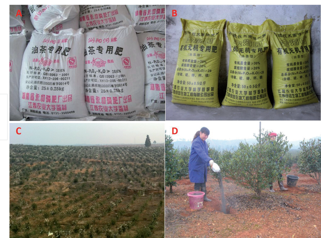
Figure 2. The College of Forestry, Jiangxi agricultural university, has developed the special fertilizer for Camellia oleifera to guide the precise fertilization and intensive nutrient management. Notes: (A) special formula fertilizer for Camellia oleifera. (B) Special fertilizer for organic and inorganic oil tea. (C) the Camellia oleifera forest land. (D) Farmers apply special fertilizer for Camellia oleifera.

Take the research of Jiangxi Agricultural University that I studied as an example. The College of Forestry in Jiangxi Agricultural University is at the forefront