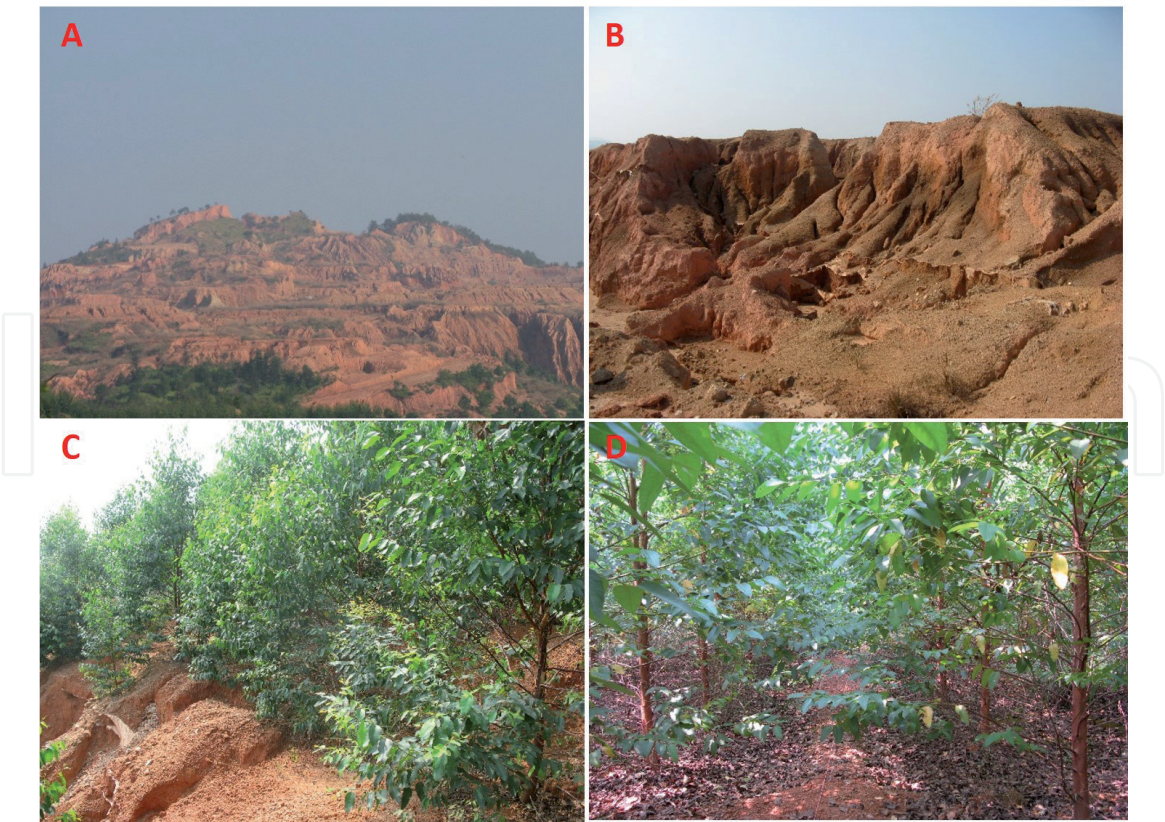
Figure 4. Vegetation restoration and afforestation with nutrient management technology in rare earth mines in South Jiangxi Province, China. Notes: (A and B) Rare earth tailings are barren. (C and D) Successful afforestation through nutrient management technology.