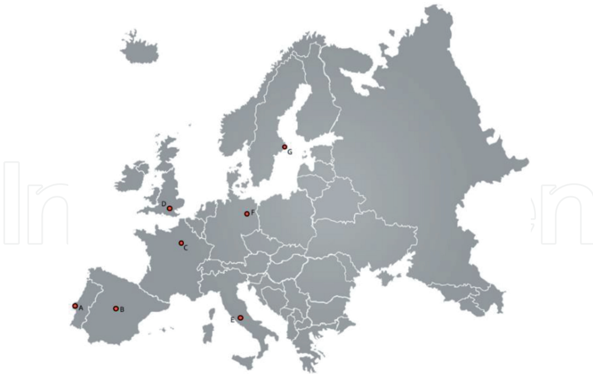
Figure 1. Selected case studies. (A) Lisbon, (B) Madrid, (C) Paris, (D) London, (E) Rome, (F) Berlin, (G) Stockholm.

and 2018 was carried out. Nevertheless, for the cities of London and Stockholm for 1990, there was no data.