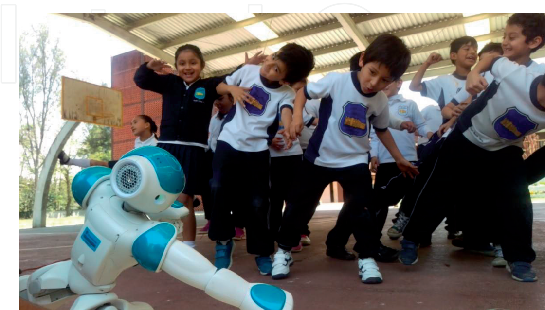
Figure 3. Physical education class with the support of a robotic platform.

A critical feature that elementary school needs to develop on their students is the ability to use mathematical and logical thinking in daily life situations. For this