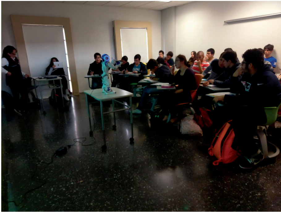
Figure 5. Use of a NAO robot in a high school class.

The study described in [20] analyzes how much attention a group of high school students give during a mathematics class when the teacher uses a NAO robot.