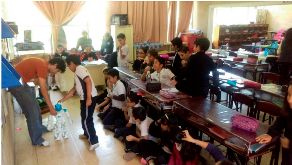
Figure 4. Metric system evaluation with a robotic platform.

High school students are more accustomed to the use of novel technological platforms and their use in daily life activities. For the same reason, the novelty of using robotic platforms during class may not be that interesting at first glance to them. The lack of novelty could even produce the reduction of the attention span during class. For this reason, it would be proven useful to evaluate the attention span of high school students during class, when the instructor is using a robotic platform, as illustrated in Figure 5 .