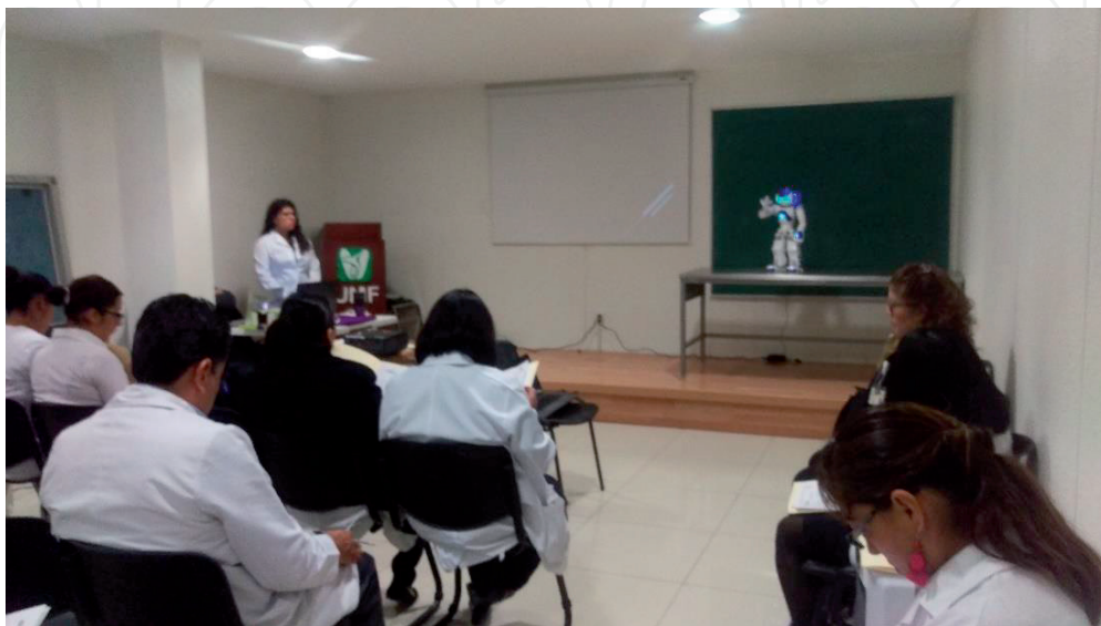
Figure 2. Use of a robotic platform for medical students training.

The results obtained from this study showed no significant difference between the evaluation and perception results obtained from the group that interacted with the robot and the regular group. As strange as it sounds, this is an excellent result since it can be concluded that a robotic platform is equally as good as a professional when explaining specific content to a group of people. It would still be necessary to control some environmental characteristics to make sure the results are as expected. However, it opens the doors for implementing these platforms in specialized training environments.