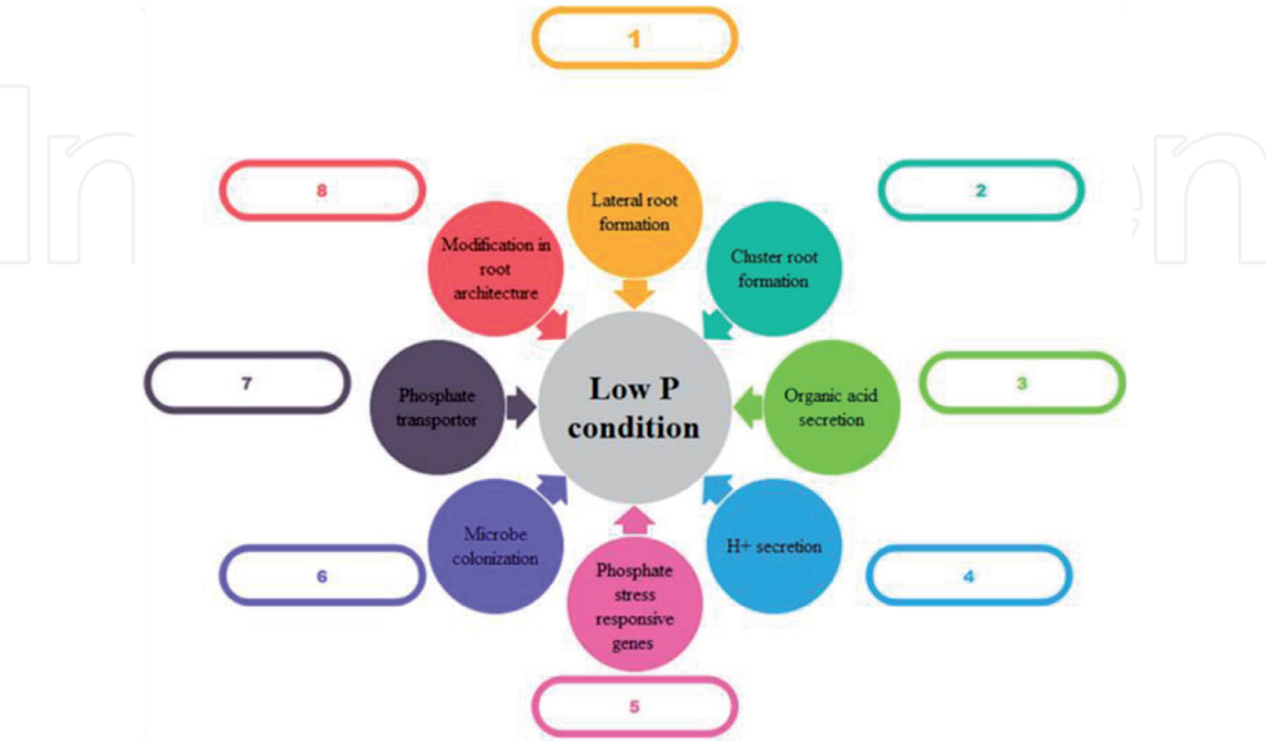
Figure 1. Under P stress condition plant evolved multiple adaptive responses to improve Pi uptake, recycling and transportation [11–18].

Previous studies have shown that the exudation of PAP (purple acid phosphatase) may facilitate the use of organic P for plants [25, 26]. Membrane localized high affinity transporters (PHT1) also exhibit great contribution in improving P uptake, and have been recognized in soybean, rice, and wheat roots [27–30]. Arbuscular mycorrhizal fungi (AMF) symbiotic association plays vital role in improving plant