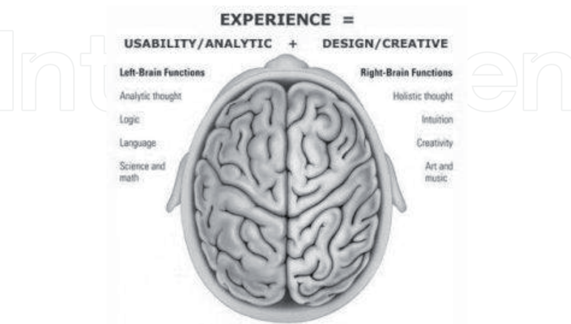
Figure 1. Functions of the left and right brain spheres [25].

Both trance and suggestions can be induced using the visualization technique. For instance, a subject can be asked to recall a room he is familiar with, to imagining every detail in the room such as the windows, the floor, the light, the wall, the painting etc. Afterward, the subject then moves into a room he is less familiar with. As the subject struggles to recall the exact details, his mind is open to suggestion. Visualization can be used to recall positive memories and positive images and experiences (wedding, birthday graduation) to change one's perception of a negative image [25].