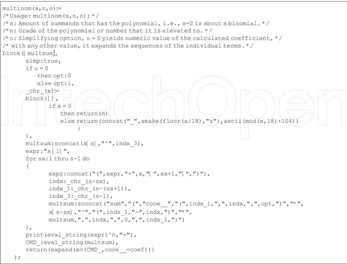
Figure 3. Program: multinom.