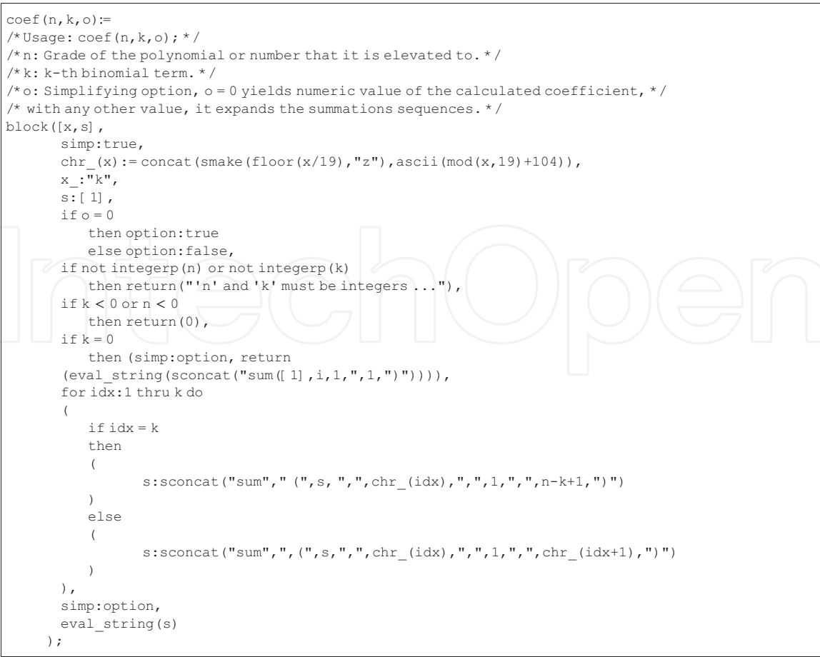
Figure 2. Program: coef.