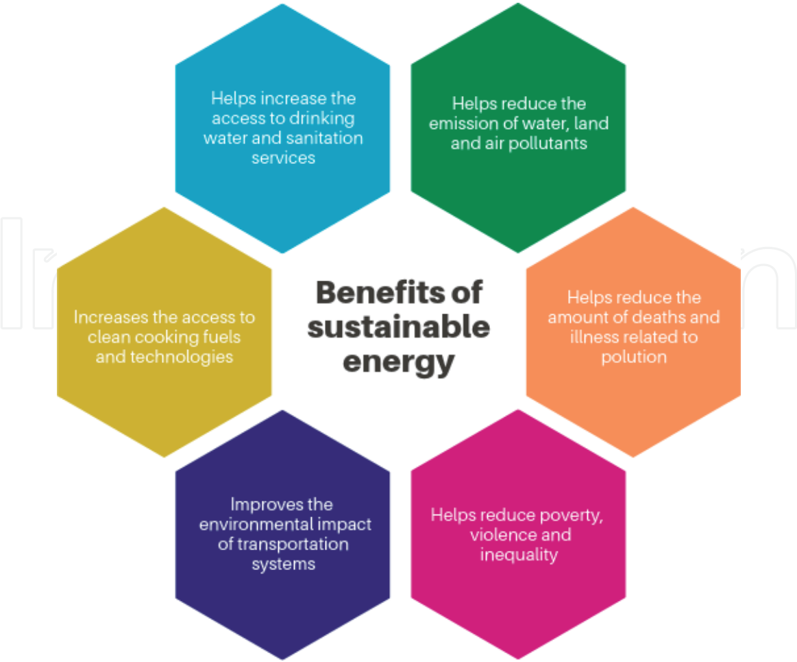
Figure 2. Social benefits of sustainable energy. Note: Graphic created by the authors.

translates into adverse health effects [26]. Likewise, increasing the access to clean and sustainable energy is particularly relevant for communities that are faced with extreme temperatures and need to use energy either in cooling or on heating systems [28].