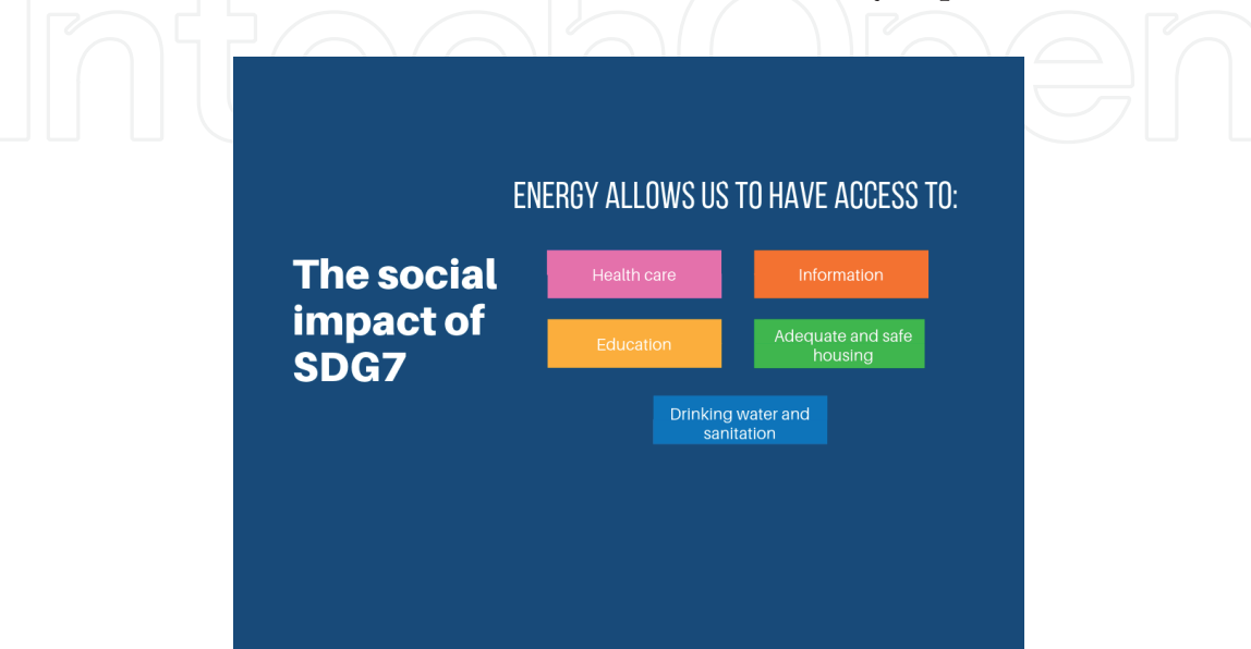
Figure 1. Energy allows us to meet our basic needs and have access to basic services. Note: Graphic created by the authors.

One of the most pressing challenges in the world is to increase the access to clean cooking fuels and technologies. In 2017, only 61% of the global population had access to clean cooking fuels and technologies, which meant that the other 39%, almost 3 billion people, relied on inefficient and polluting cooking systems [24]. The use of wood, charcoal, and dung as fuel for cooking or for heating results in a constant interaction with smoke that includes a variety of pollutants and