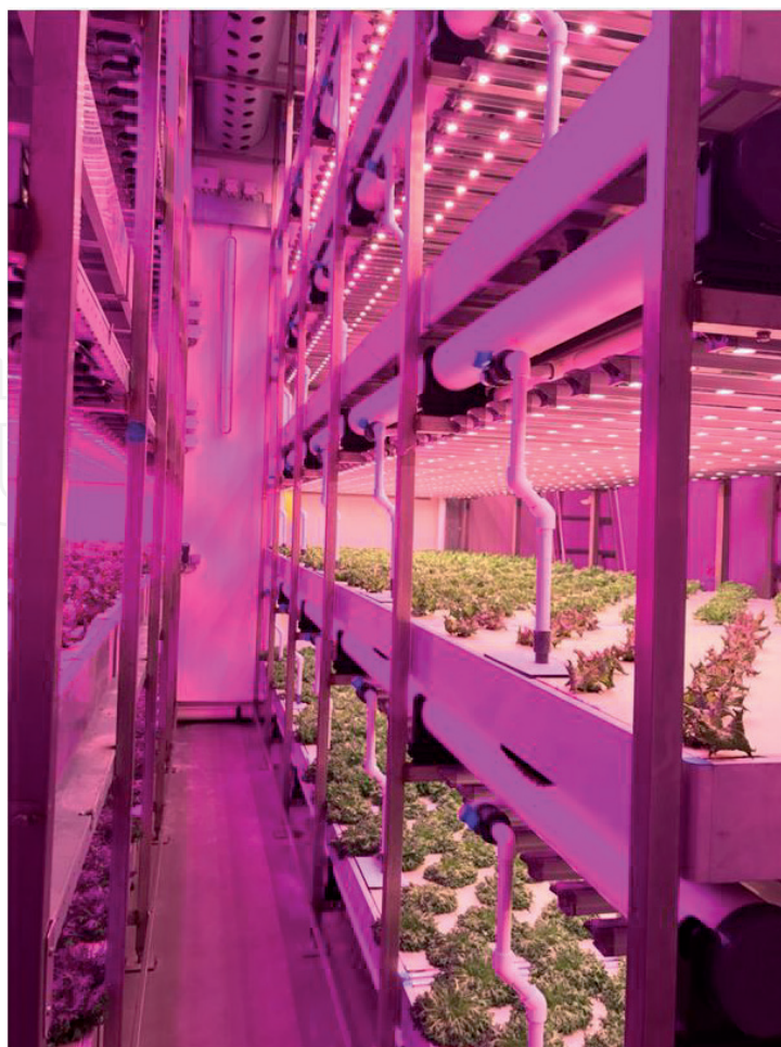
Figure 3. LED lightning in protected area without day light.

in optimizing photosynthesis, photomorphogenesis, and nutrient contents. LEDs make easier monitoring of nitrogen absorption by leafy plants and avoid harmful nitrate concentration in leafy plants and its influence on human health.