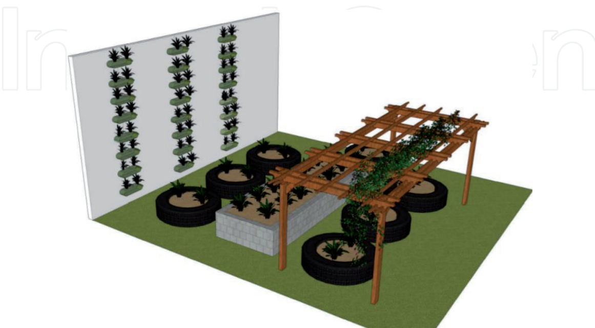
Figure 1. Proposal of an agropedagogical space of recyclable materials.

With the short space, it was proposed to build units of vertical vegetable gardens using pet bottles that can be collected by students at their homes, vegetable gardens