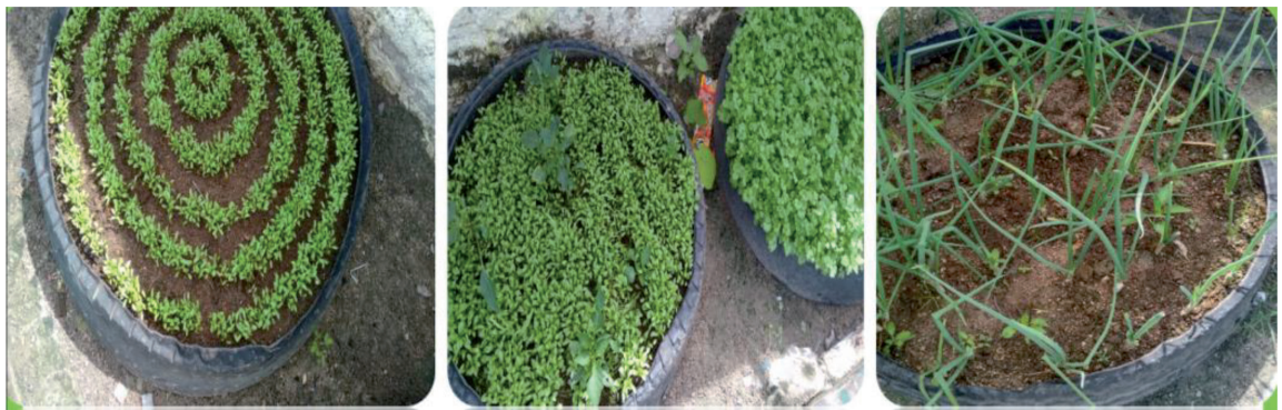
Figure 3. Vegetable bed with the use of tires.