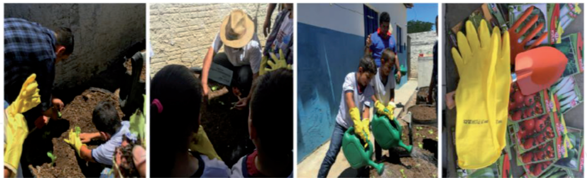
Figure 2. Planting with technical guidance.

In addition to providing a better nutrition to school students, it also ensured a greater awareness about the natural assets and valorous vision about the