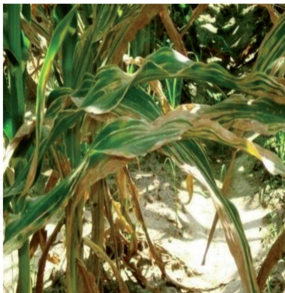
Figure 14. Maize crop attacked by brown stripe downy mildew.

favors the development of disease. Destroy the infected crop residue in the field. Grow improved varieties. Follow spray schedule as against Brown stripe downy mildew [7, 8].