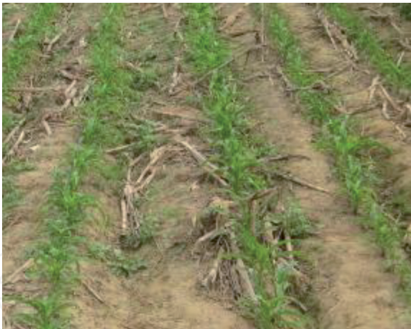
Figure 1. Maize crop sown under zero tillage system.