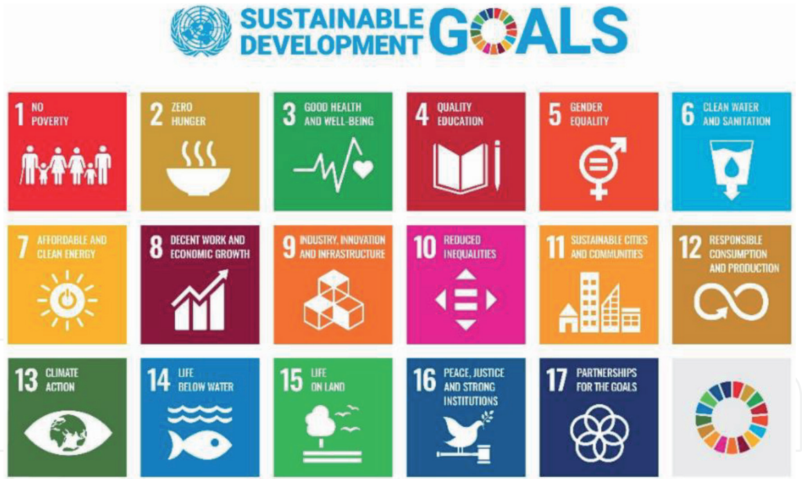
Figure 2. The 17 sustainable development goals [3].

The UN SDGs aim ambitions and necessary targets across a wide range of socio-economic, environmental, and governance issues in order to reduce the significant gaps between high-income countries and emerging economies in terms of population access to critical services (health, education, public utilities, infrastructure) and to limit the extreme poverty among the most vulnerable populations from Asia, Africa, Latin America, or Eastern Europe.