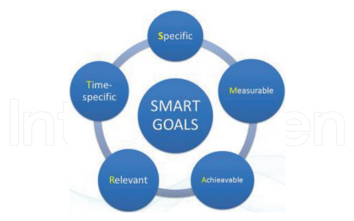
Figure 1. SMART goals for a clinical assessment tool.