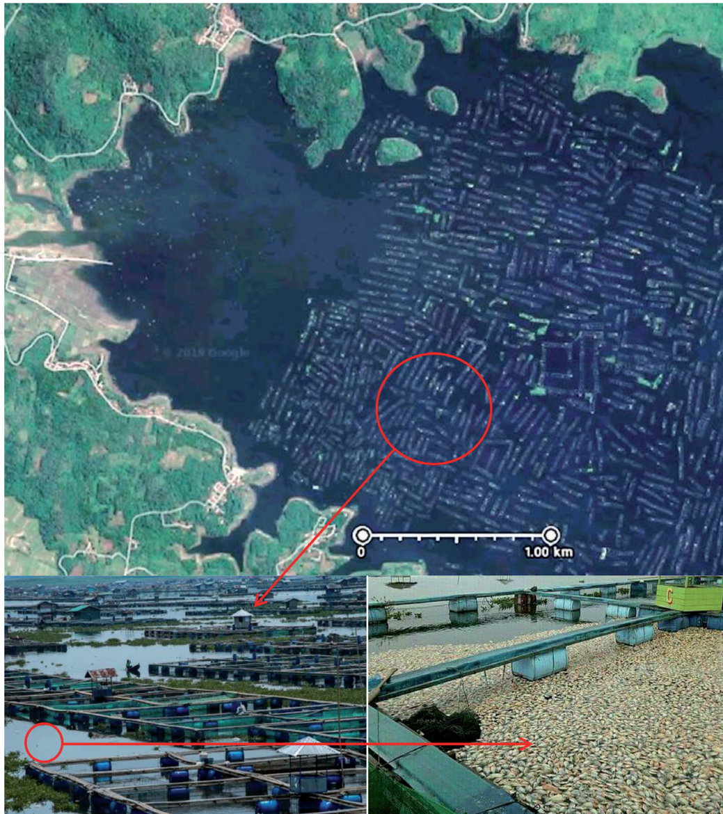
Figure 1. Aerial image of Cirata dam located in West Java, Indonesia (upper) showing uncontrolled density of floating cage aquaculture causing rapid degradation in its water quality (lower-left); deaths of thousands of tons of fish in floating cages aquaculture due to lack of oxygen and rising toxic gas (lower-right) causing economic loss of approx. USD 28.5 million [29]. Image courtesy of Google maps [31–33].

those who take advantage of situations of animal stress in high stocking density, poor nutrition to cause infections, low growth and feed efficiency rates, and even death ( Figure 1 ).